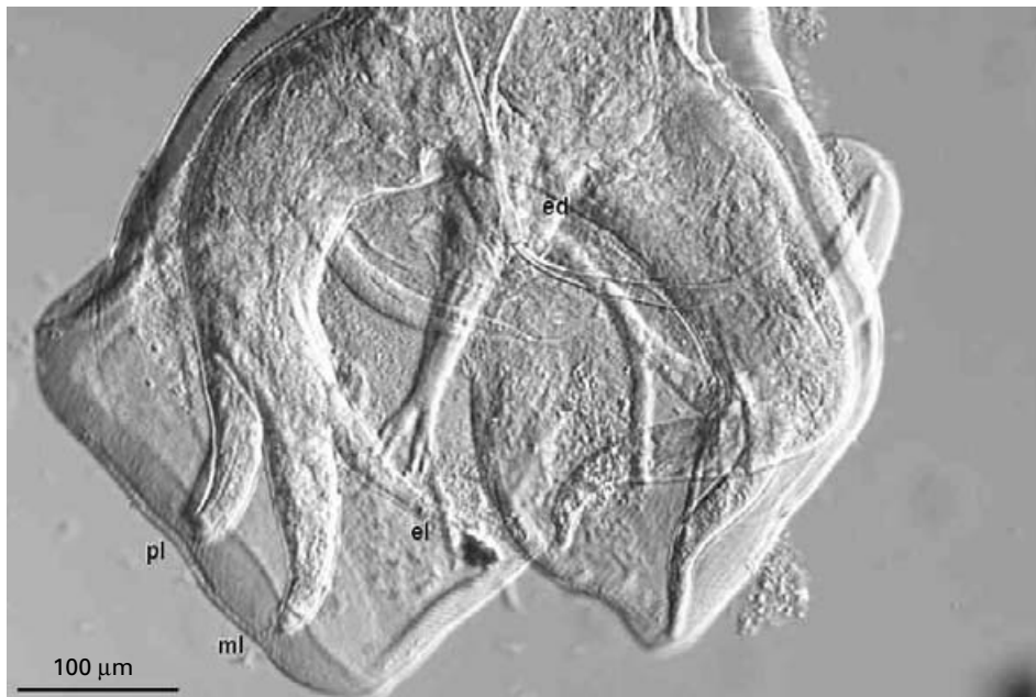
Fig. 2. Ventral view of bursa of male Ancylostoma braziliense from a cat from Cocos Island. Rays are marked as in Fig. 1.