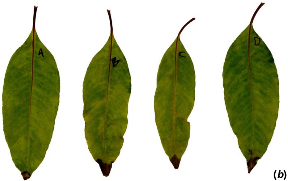
Fig. 1. Symptoms on leaves of Pittosporum undulatum inoculated with Phytophthora ramorum zoospores. (a) Lesion 32 hours after inoculation. (b) Range of symptoms observed on inoculated leaves 20 days after inoculation.