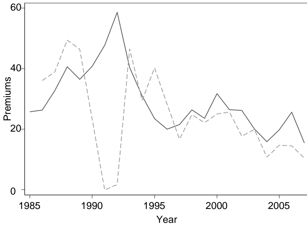
Panel A: Average yearly premium for LBOs and non-LBO takeovers

This figure illustrates the average yearly distribution of LBO premiums and deal values. The sample contains 844 LBOs worldwide and 4,461 non-LBO takeovers from 1995 to 2007. We exclude takeovers that involve private targets, divisions of public companies, a deal value of less than $10 million, and deals with no premium data reported or an acquirer's final stake less than 50%. We also include additional data (from Thomson Financials) on LBOs and other takeovers between 1985 and 1994. Panel A shows the average yearly premiums of LBOs and other takeovers from 1985 to 2007; Panel B shows the average yearly premiums of club and non-club LBOs from 1995 to 2007. The dashed line represents LBOs in Panel A and club LBOs in Panel B, and the solid line represents strategic takeovers in Panel A and non-club LBOs in Panel B, respectively. We calculate the premium as the offer price over the stock price one day prior to the announcement minus one.