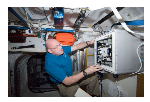
Fig. 6: Andre Kuipers works with the ROALD-2 experiment in KUBIK-3