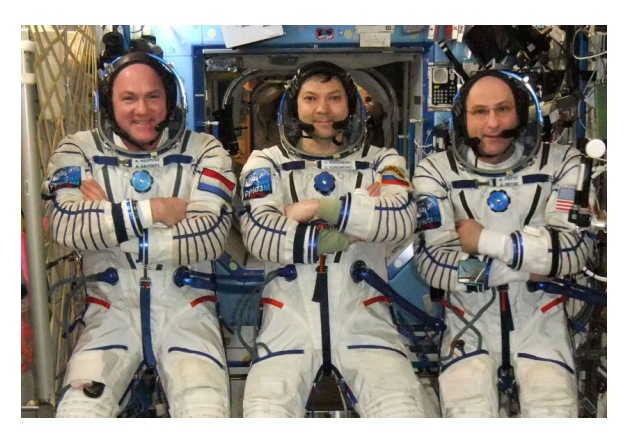
Fig. 1: Andre Kuipers, Oleg Kononenko, Expedition 31 commander and Don Pettit in their Sokol suits

On 21 December 2011 the next ESA astronaut André Kuipers was launched to orbit in Soyuz 29 capsule from Baikonur. He arrived at the ISS on 23 December together with his crew mates Oleg Kononenko and Don Pettit (see Fig. 1). After about two months they learned that they will have to stay 6 weeks longer in orbit due to a delay in the launch schedule of the subsequent Russian Soyuz capsule. Hence, André Kuipers and his crew mates had to stay until 1<sup>st</sup> July 2012 until they could go back to earth.