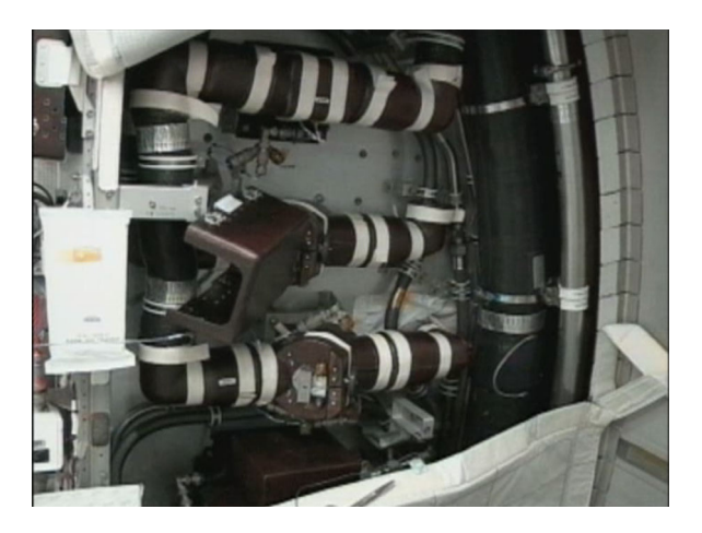
Fig. 2: WOOV 2/4/5 during inspection

After the successful WOOV-8 replacement in 2011 and the subsequent inspection and analysis of the hardware on ground it was realized that also the other WOOVs have to be inspected and possibly treated specially. On 14 October 2011 the WOOV 3/4/5 inspection was performed (see Fig. 2). During the inspection Satoshi Furukawa cleaned the WOOVs and insulated the WOOV to avoid contamination in future.