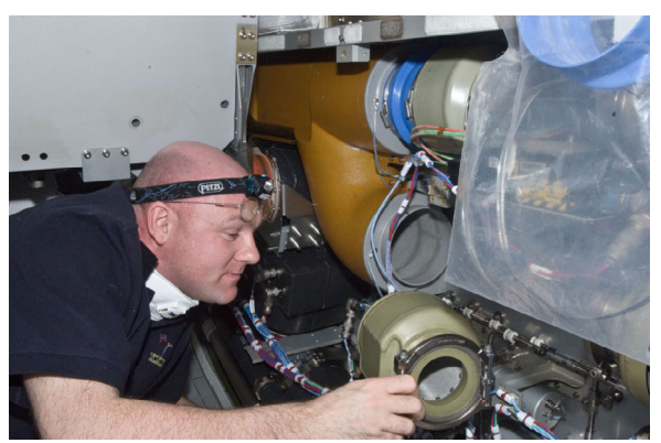
Fig. 3: André Kuipers during inspection and cleaning of the CFA ducts

The same inspection is planned to be performed for the other WOOVs. The manifold which replaces WOOV-8 since the beginning of 2011 will be replaced again by a new WOOV valve by end of 2012.