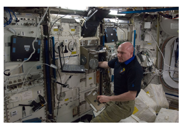
Fig. 5: André Kuipers support a Biolab Health check.

To get ready the Biolab rack for the next experiments planned for the upcoming increments a series of maintenance activities of the rack have been prepared and performed by MUSC. Fig. 5 shows André Kuipers supporting a Biolab Health check in Columbus which was one of several planned activities with this rack in the last months. When all maintenance activities are finished in a few months, Biolab will be again available for experiment support in Columbus.