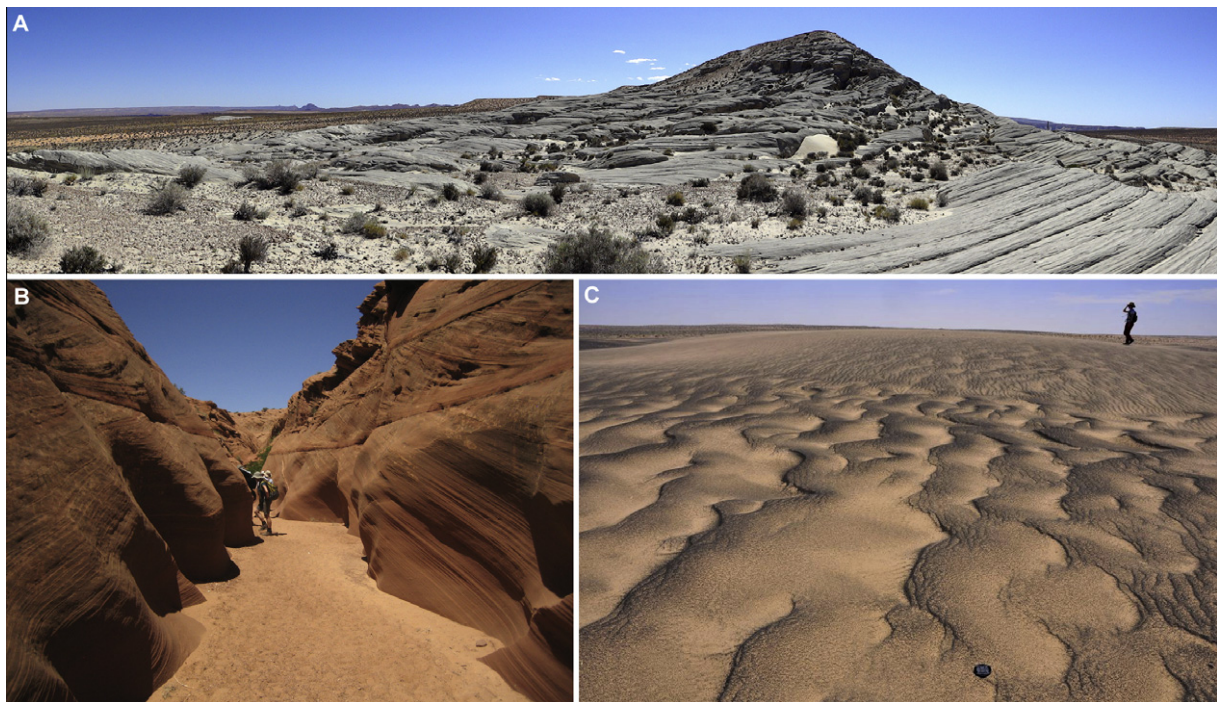
Fig. 2. Field trip sites. (A) Entrada Sandstone, exposing a complex oblique dune with superimposed secondary transverse dunes, (B) Navajo Sandstone, with crossbedding revealed in the steep walls of a wash, and (C) Grand Falls Dune Field, showing low barchans and coarse-grained ripples composed of finer, bright sand and coarser, dark granules.

The International Planetary Dunes workshop was the third in a series of meetings, listed in Table 1 (Titus et al., 2008, 2010, 2012; Fenton et al., 2010). The goal of all such workshops has been to foster collaboration between terrestrial and planetary aeolian researchers, including those who perform studies with models, in laboratories, in the field, and with remote sensing data. Recent work attests to the vigor of research in this rapidly expanding field (Zimbelman, in review/this issue?). Timothy N. Titus (USGS, Flagstaff) convened this meeting with a scientific organizing committee including Mary Bourke (Planetary Science Institute), Lori Fenton (Carl Sagan Center at the SETI Institute), Rosalyn Hayward (USGS, Flagstaff), Briony Horgan (Arizona State University), Nick Lancaster (Desert Research Institute), and David Rubin (USGS, Santa Cruz). As with the two preceding workshops, this one was designed to have an intimate atmosphere to encourage discussion; a total of 48 participants registered. Each speaker was given 30 min to talk and strongly encouraged to leave half of that time open for questions. Extended abstracts follow the standard two page format of the Lunar and Planetary Institute, and may be found at the meeting website: http://www.lpi.usra.edu/meetings/dunes2012/ .