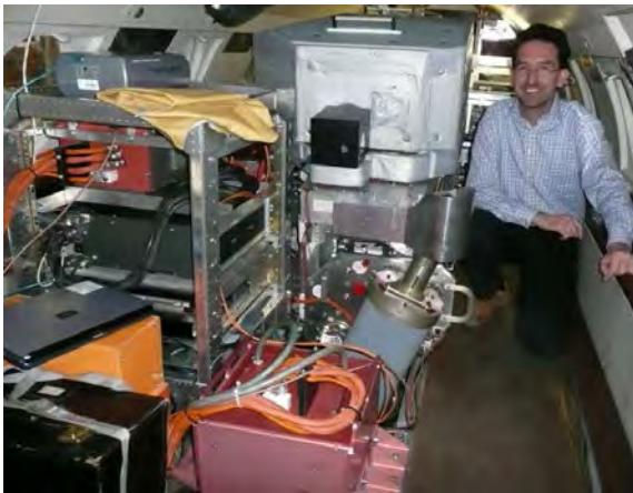
Figure 1. Photo of the direct-detection wind lidar A2D and the coherent-detection 2- \mu\text{m} DWL inside the DLR Falcon.

The direct-detection wind lidar A2D and the coherent-detection 2- \mu\text{m} wind lidar were deployed on the DLR Falcon 20 aircraft for airborne campaigns in 2007, 2008, and 2009 (Fig. 1). The A2D is based on the ALADIN receiver and transmitter from the pre-development program of ESA [3] and is therefore representative of the satellite instrument. The principle, optical layout, and specifications are discussed in detail in [8] and more specifically for the frequency-stabilized, and -tripled Nd:YAG laser in [9].