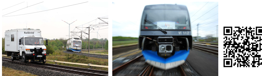
Fig. 3. BOB Integral and RailDrIVE approaching the same switch in a flank collision situation on the left, special camera for optical switch stand detection mounted on the coupling of the train in the middle, QR code of the link to the video on the right.