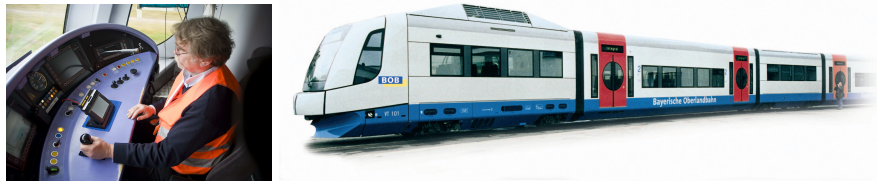
Fig. 1. Providing information to the driver about the situation as assessed by RCAS.