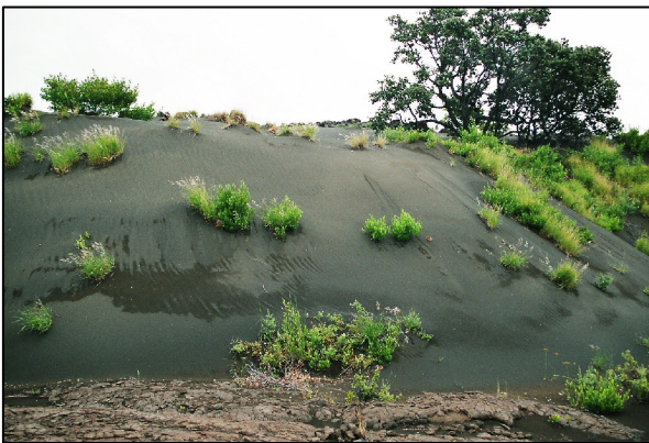
Fig. 2: Dark falling dune located off the Ka'u Desert trail at 19°19'29"N, 155°21'51.15"W (sample 1).