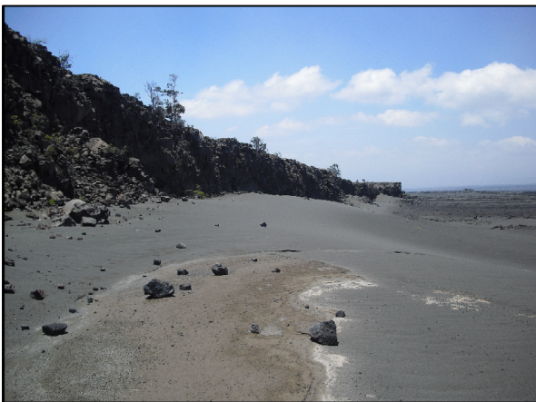
Fig. 3: Dark climbing dune located at the base of a small pali along the Mauna Iki trail at 19°20'39.43"N, 155°18'26.56"W (sample 2), (see also [9]).