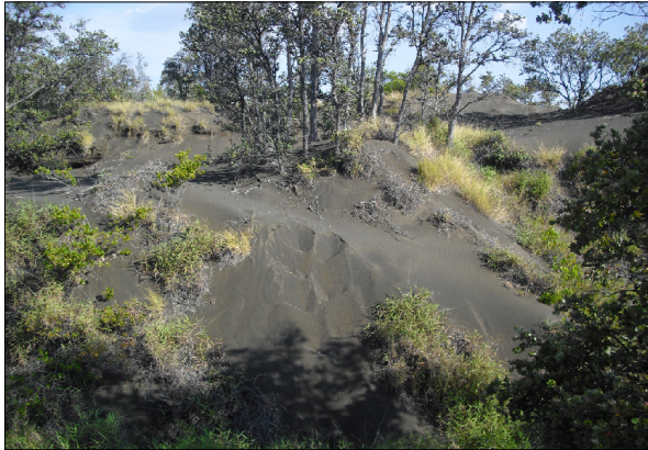
Fig. 1: Dark parabolic dune located off the Footprints trail at 19°21'17.52"N, 155°21'51.59"W (sample 6).