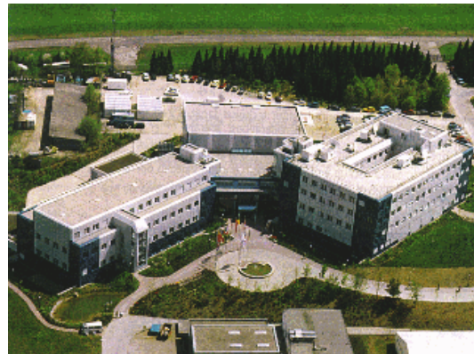
Fig. 1: GSOC with SCC and Col-CC

GSOC has 170 DLR staff and 150 staff from contractor companies, supporting mainly software development, special expertise, peak situations and shift work.