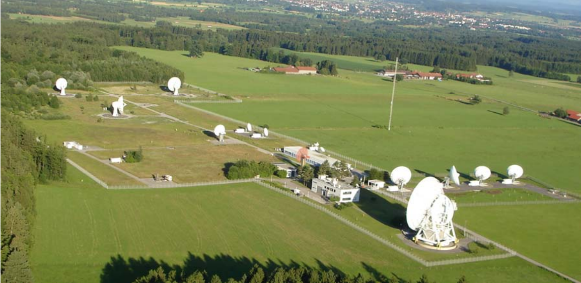
Fig. 3: Weilheim Ground Station Complex