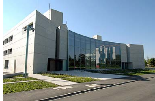
Fig. 2: Galileo Control Center

applications are generated on the ground in the control centers and transmitted to the Galileo satellites via the ground stations.