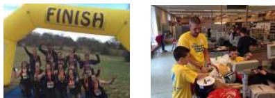
Figures 3 & 4: Fundraising Events

Discounts have also kindly been agreed on venue hire and activities run during the family days.