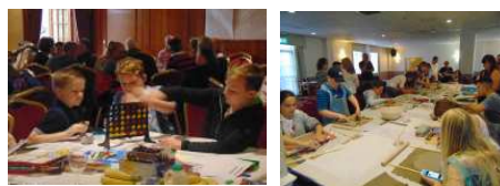
Figures 4 & 5. Activities at Event 2 & 3