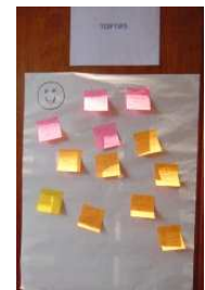
Figures 6. Obtaining Feedback