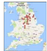
Figure 2: North of England Spread of Children with Narcolepsy

The aim of these events are to enable the families to interact, discuss their concerns, share ideas and keep up to date with the latest narcolepsy research.