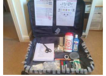
Figure 3. Additional equipment needed to set up the PSG Child set up with the PSG equipment recording in the home