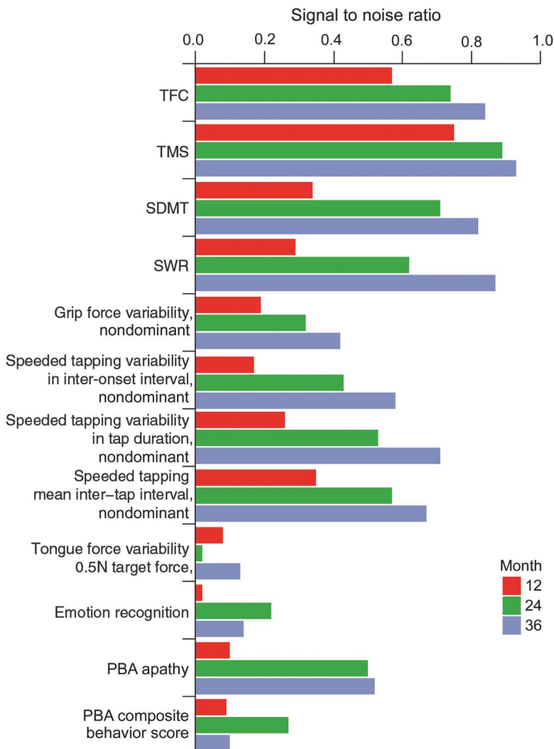
Figure 1 Longitudinal S/N ratio of UHDRS and non-UHDRS clinical measures in early HD (stages I and II at baseline) across the motor, quantitative motor, cognitive, behavior, and global functional domains in the TRACK-HD sample

HD = Huntington disease; PBA = Problem Behaviors Assessment; SDMT = Symbol Digit Modality Test; S/N = single-to-noise; SWR = Stroop Word Reading Test; TFC = Total Functional Capacity; TMS = Total Motor Score; UHDRS = Unified Huntington Disease Rating Scale.