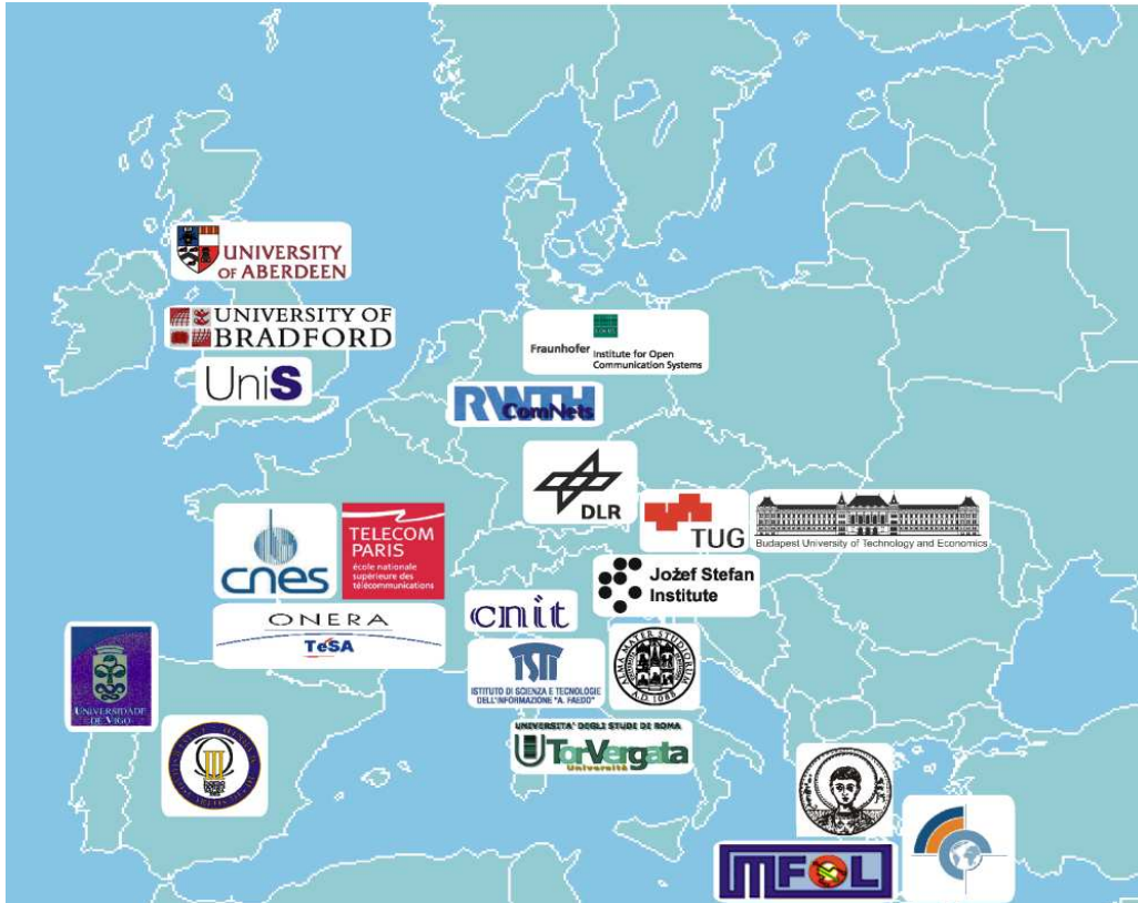
Figure 1: SatNEx partners in Europe.

The philosophy underlying the SatNEx approach consists in the selection of focused actions within the broad framework described by the overall JPA, in order to capitalize on the expertise that are present within the network and to make sure that the integration is effective and durable. These focused actions are to be carried out jointly by the partners, and are identified as joint activities (JAs). They include research, integration, and disseminating activities. The research activity, in particular, focuses on knowledge gaps that may be present within the network and on extending the knowledge which is brought in at the project start-up by the various partners. The emphasis will be on the challenge to existing concepts and ideas, in the never ending search for improvements and breakthroughs, which can only be achieved by leaving the field open to exploratory research activities. Finally, the time schedule as well as the envisaged deliverables and milestones, are illustrated in Fig. 4 and Table 2.