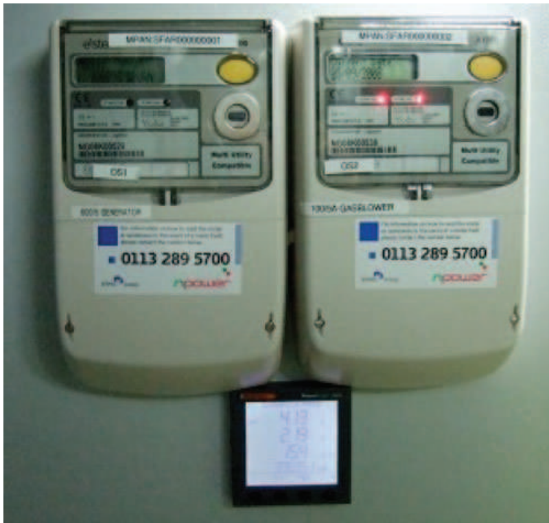
FIGURE 3. ROC meters for a digester.

Because of the epistemological significance of double-entry bookkeeping as a source of demonstration, Poovey situates it as a precursor to the “modern fact.” The virtual market in renewable credits is essentially a market in facts—but facts for whom?