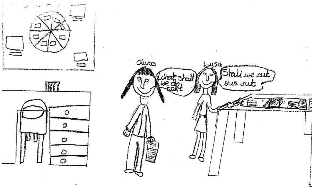
Figure 2. History lesson by Y4 in Shears Green School