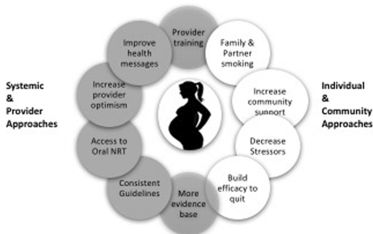
Fig. 3 Approaches to improve smoking cessation among pregnant Indigenous women

In specifying the target behaviour, the BCW guidebook recommends consideration of Who, What, When, Where, How often and with Whom. The target behaviour therefore would be for clinicians (Who) in the ACCHS (Where) to proactively offer assistance to every pregnant Indigenous smoker (Whom) to quit smoking (What), initially by counselling, but importantly by offering NRT, if the woman was not able to achieve