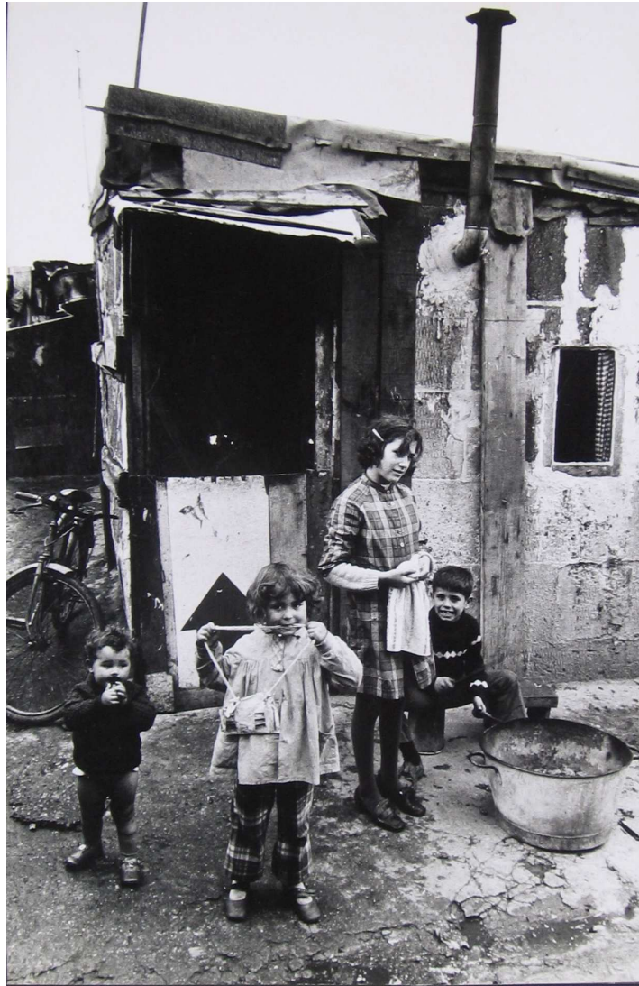
Bidonville, Aubervilliers.