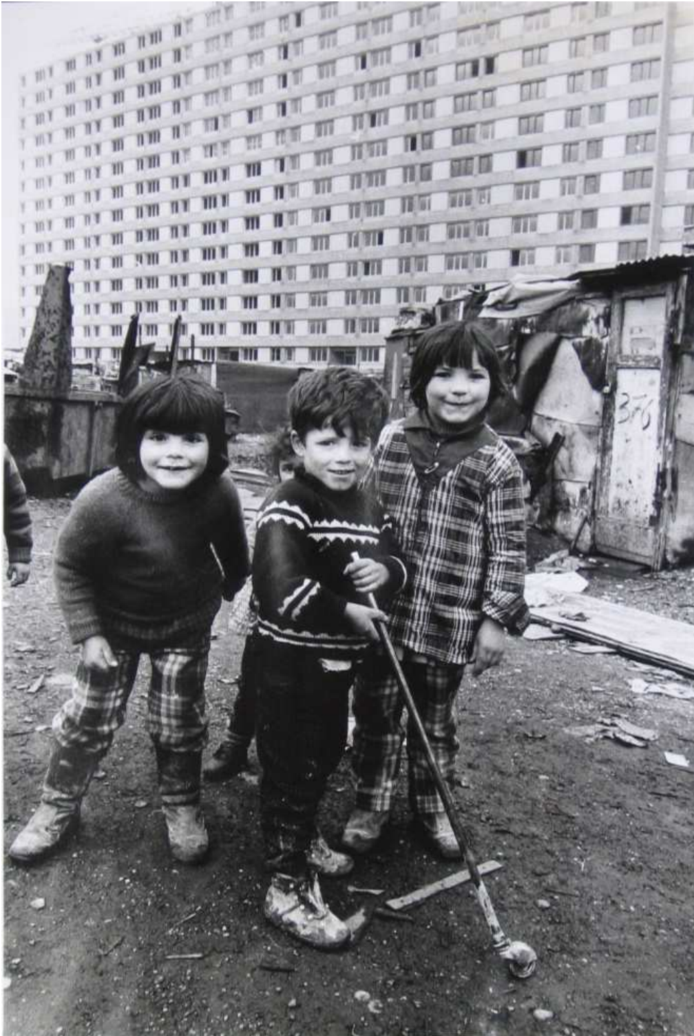
Bidonville, Aubervilliers.

In December 1964, the minister of Economy and Finance Michel Debré announced plans to end this phenomenon for good. He promised that the Caisse des dépôts et consignations (deposit and consignment office) would construct very affordable