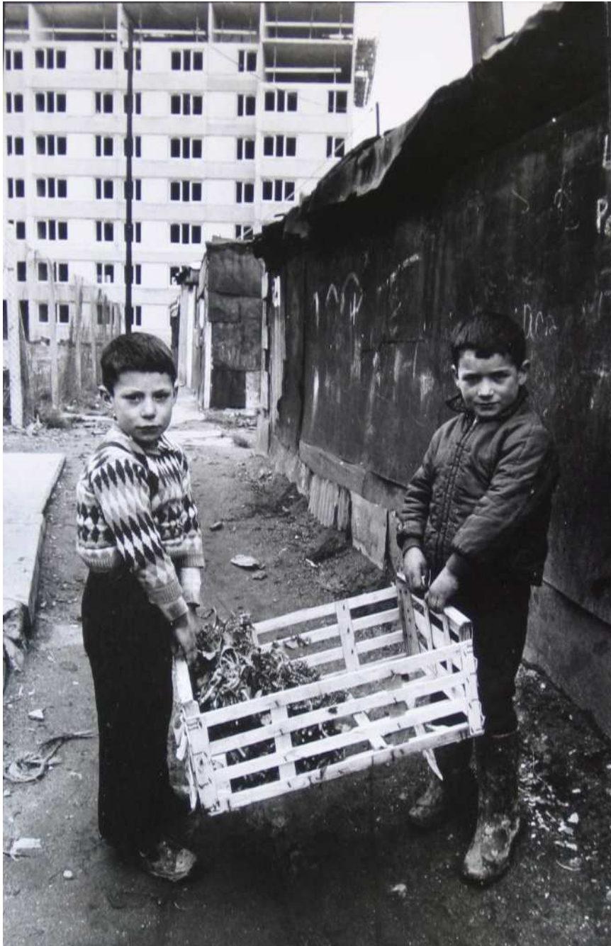
Bidonville , Aubervilliers.

The nomenclature of bidonvilles by the popular press also establishes spatial division by the stigmatisation of places. Beyond the perceived filth of the bidonvilles , the language of Le Parisien hints at an assumed immorality of the poor workers inside. It writes of ‘ Taudis – destructeurs de toute vie familiale décente ’ (slums – destructors of all decent family life), 47 and gives the impression that the foreign bidonville inhabitants are dangerous to the local French population, the latter being, the paper claims, subjected to overcrowding and always watching out for danger. 48 Although