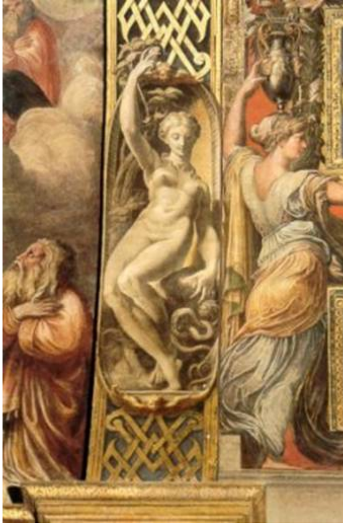
Figure 2. Parmigianino. Eve , circa 1531-1539 Santa Maria della Steccata Church, Parma

Courtesy Santa Maria della Steccata Church