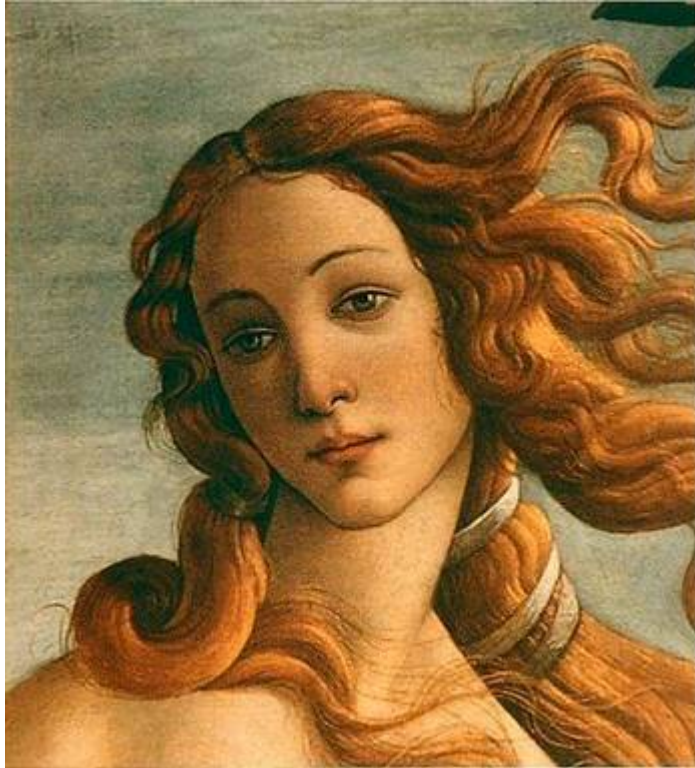
Figure 1. Sandro Botticelli. The Birth of Venus, circa 1483-1485 tempera on canvas, detail

Resemblance is here expressed through duplication, via the anaphora and the alliterations in [s] and [b]. Humbert repeatedly deplores his inability at “fixing the perilous magic of nymphets” ( Lo 134), so he resorts to a pictorial reference, which gives him the delusion that he can conjure up and master the metamorphic image of the nymphet within the frame of a painting.