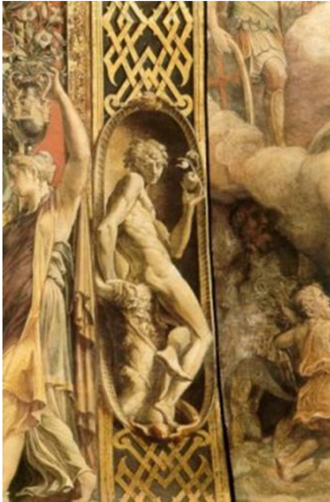
Figure 3. Parmigianino. Adam, circa 1531-1539 Santa Maria della Steccata Church, Parma

The following ekphrastic description provides a typical example of Nabokov's treatment of nudity: