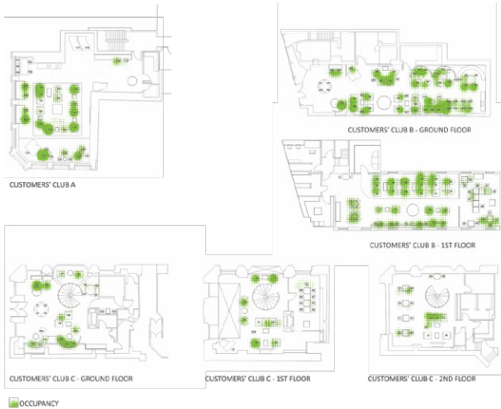
Figure 2 - Density maps for overall occupancy patterns produced by snapshot method - denser shade represents more popular seats

Firstly, the distinct furniture types (figure 1) were plotted against seat occupancy to investigate differences in popularity by furniture type. The analysis of variance (ANOVA) illustrated a moderate and significant correlation of variance ( R^2=0.29 p<0.001 ), which indicates that furniture type plays a role for seat selection but is not the main driver. The analysis highlighted that people preferred more comfortable seating; specifically, a distinct preference for individual armchairs emerged since this type of furniture recorded the highest mean occupancy (46% for type 2 and 46% for type 4). Sofas as well as booth areas illustrated average occupancy levels close to 40%. The least preferred furniture type was the entrance bench.