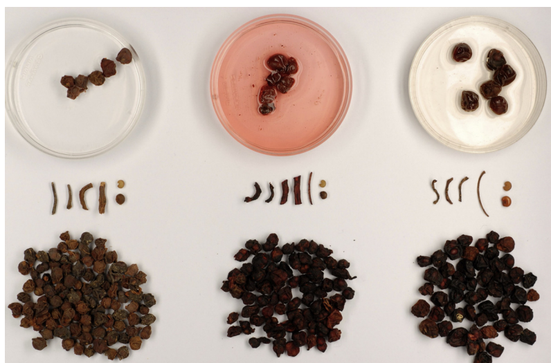
Fig. 3. Left: Kew reference drug of Nan Wu Wei Zi (fruit of Schisandra sphenanthera , EBC 80419). Middle: sample traded as ‘Wu Wei Zi’ (EBC 83897, dispenser 7), identified as Nan Wu Wei Zi ( S. sphenanthera ) and dyed (middle petri dish). Right: Kew reference drug of Bei Wu Wei Zi (fruit of S. chinensis , EBC 80572). Top row: the 3 samples after brief immersion in water. The ruler indicates 1 mm.

The marked difference in quality between drugs harvested from the wild, of which 36% of samples were either of the incorrect