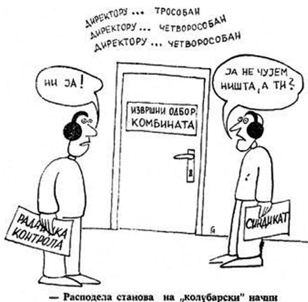
Figure 3. Cartoon from workplace periodical Kobubara (August 1978) 'The distribution of flats the "Kolubara" way'.

Source: Živanović, "Kako je Milan Gambelić osetio moć karikature".