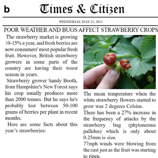
Fig. 1 Stimuli used in Experiments 1a (left) and 1b (right). The information contained in the right column of each picture was shown again when participants were asked to rate the explanations

causal influence) were meant to capture potential differences between “what” and “how” causation (Gerstenberg, Goodman, Lagnado, & Tenenbaum, 2015). In other words, it may be the case that participants prefer concrete terms (e.g., 37 degrees slope) rather than abstract terms (e.g., steep slope), even though both adequately explain what happened (e.g., a landslide), because only the concrete term explains exactly how it happened , despite the fact this is not what is being asked.