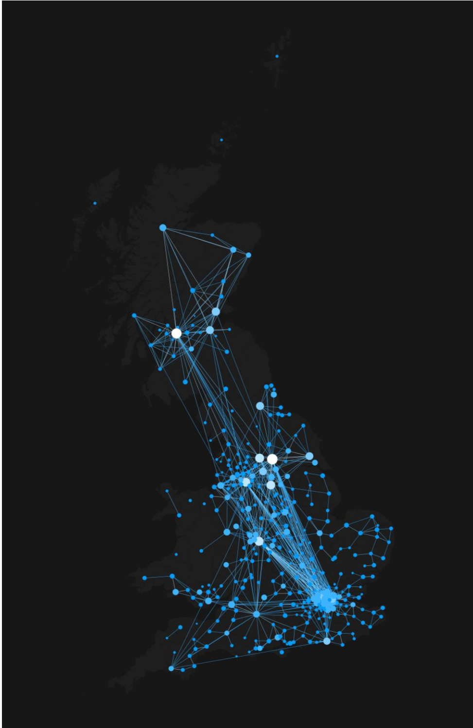
Figure 2 A representation of internal migration within Great Britain. Migration within local authorities are displayed as proportional circles whilst flows of over 40 persons between districts are represented as lines.