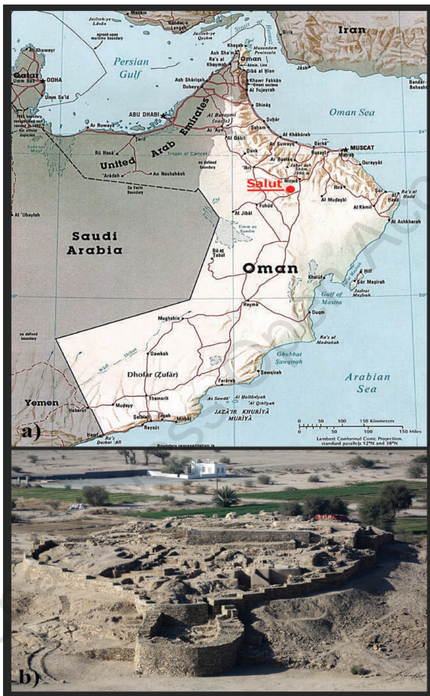
FIGURE 1. a. A map showing the location of Salūt in central Oman; b. a general view of the Iron Age site of Salūt from the east, after the restoration campaign (early 2015).