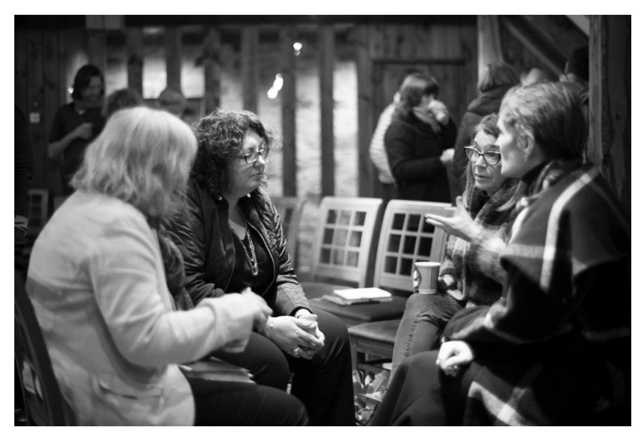
Figure 2. Group discussion at the Gathering at Brodie Castle, September 2015