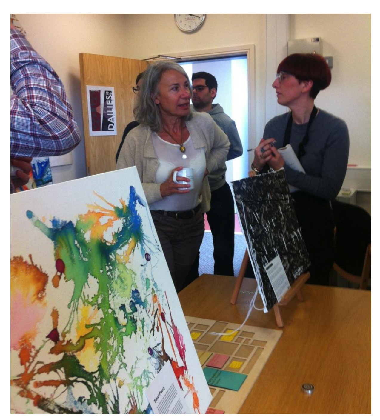
Figure 3. Discussion amongst work 'in the making', Moray, March 2016

The second set of Dailies were held in July and included representation from the PGT and PGR student cohort. As well as members of the research cohort of PhD and MRES candidates, MDES students gave presentations about their group projects, which began in January 2015. A representative from the programme discussed her team's project, Bike Hub, sparking wide interested from the audience. Bike Hub proposes the creation of a series of shelters throughout Barra. Young people would be encouraged to take ownership of the Bike Hubs and decide what they are used for. Inspired by interviews with young people and Barra Youth Café, the suggestion from the MDES students is that they could become maker spaces or meeting places. The team of three was given the theme of environmental design and the topic of health and wellbeing during Winter School. During their research the group decided to focus on Barra and became interested in how wellbeing was linked to creativity and having a good relationship with place and landscape. Field research