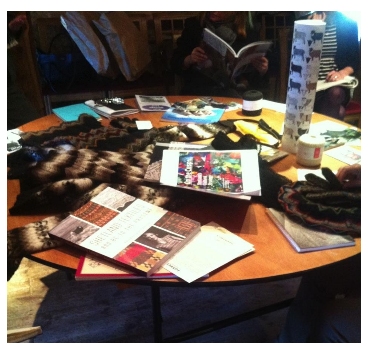
Figure 1- Material artefacts shared at the Gathering at Brodie Castle, September 2015

At the September gathering GSA reviewed possible approaches to enlightened evaluation with the help of a range of experts. Focusing on the CFP projects underway and using the material artefacts gathered on trips to the Western Isles and Shetland as well as other activities, participants reflected on the journey taken so far and shared their experiences. At the second 'major' November meeting HIE and GSA met 'en masse' to consider Harmonics for the first time. The work concentrated on: what had been the experience of HIE and GSA staff of the partnership to date; and, what preferable futures might be springing from the partnership. GSA and HIE people participated with frank and enthusiastic engagement and energy for the partnership was high. A clear question was foregrounded by participants: What is the 'partnership space', as opposed to GSA and HIE spaces? As one participant described "There is a huge amount of creativity in both organisations and it's how we join forces and meld that creativity for the wider socio and economic development of the Highlands and Islands".