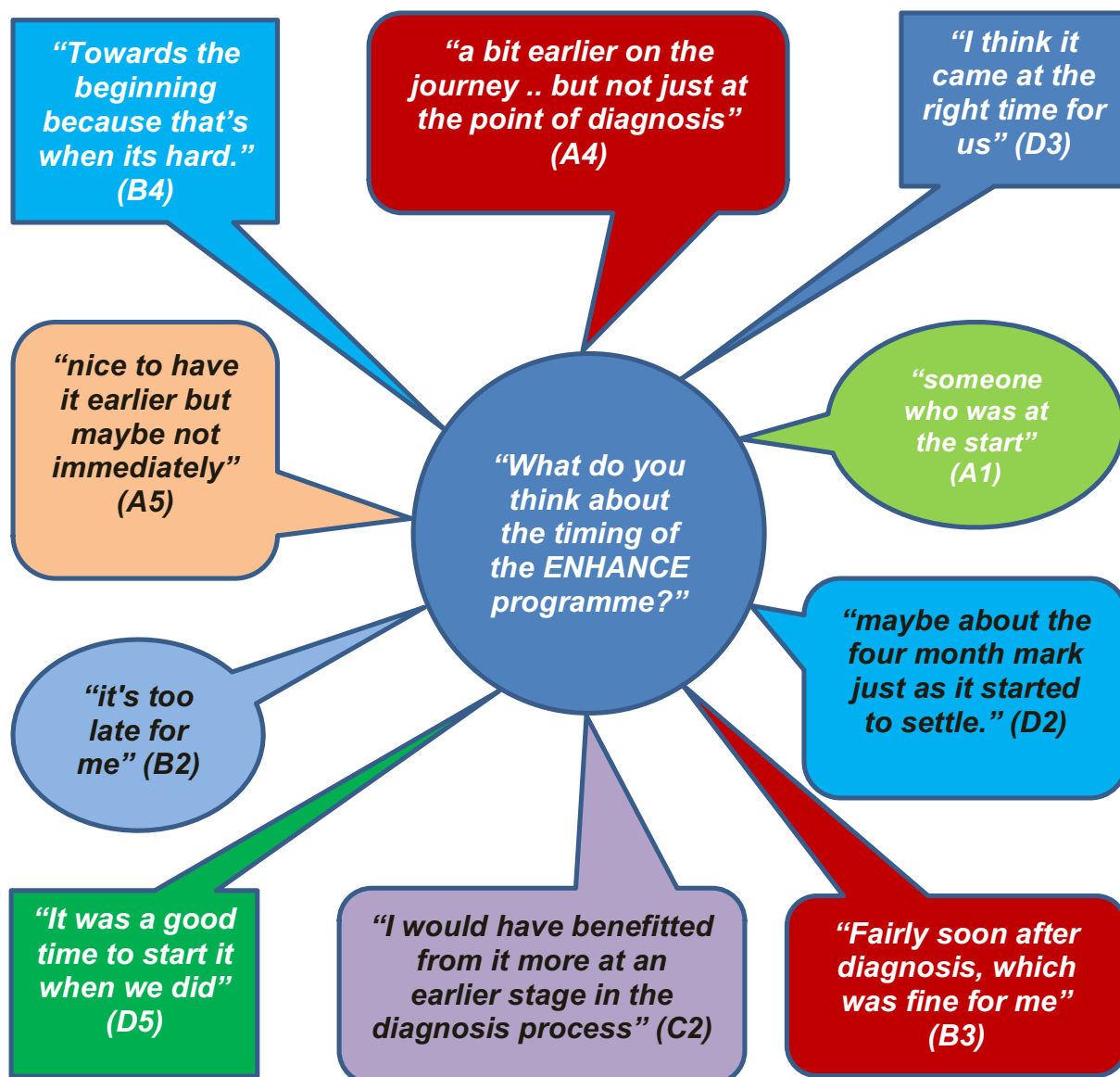
Figure 8: Parent participant views on the timing of the ENHANCE intervention.