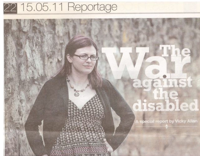
Figure 13: 'War against the disabled' in Glasgow Herald (Alan, 15 th May 2011).

been forced onto the defensive and charities have sought to increase the power of their argument by working together to voice their interests, for example through the 'Disability Benefits Consortium' ( http://www.disabilityalliance.org/dbc.htm ).