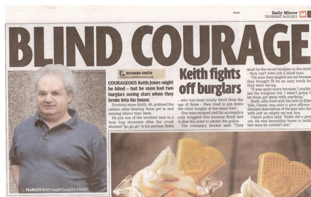
Figure 4: ‘Blind Courage’ in The Mirror (Smith, 24 th March 2011).

“should cast into sharp relief our own gripes and grumbles” (Hardy, 3 March 2011).