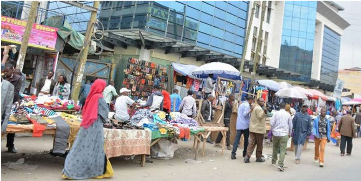
Traders in malls at Eastleigh