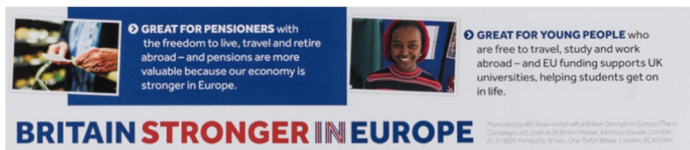
Image 3: Extract from ' 100 days to secure our future ', Britain Stronger In Europe

Meanwhile, in the same debate about freedom of movement, references to British people were almost entirely positive. Remain campaigners stressed the benefits of free movement for UK citizens who wish to 'travel, work, study, and retire in the EU, without visas' ( a leaflet by Wales Stronger In Europe ). The official national Remain campaign insisted that freedom of movement was 'great for pensioners', 'great for young people' and 'great for holidaymakers' (Image 3). It perhaps failed to recognise that those groups (British retirees living abroad, students and younger people, and those who travel frequently) did not necessarily represent key voters who needed much persuasion to vote Remain.