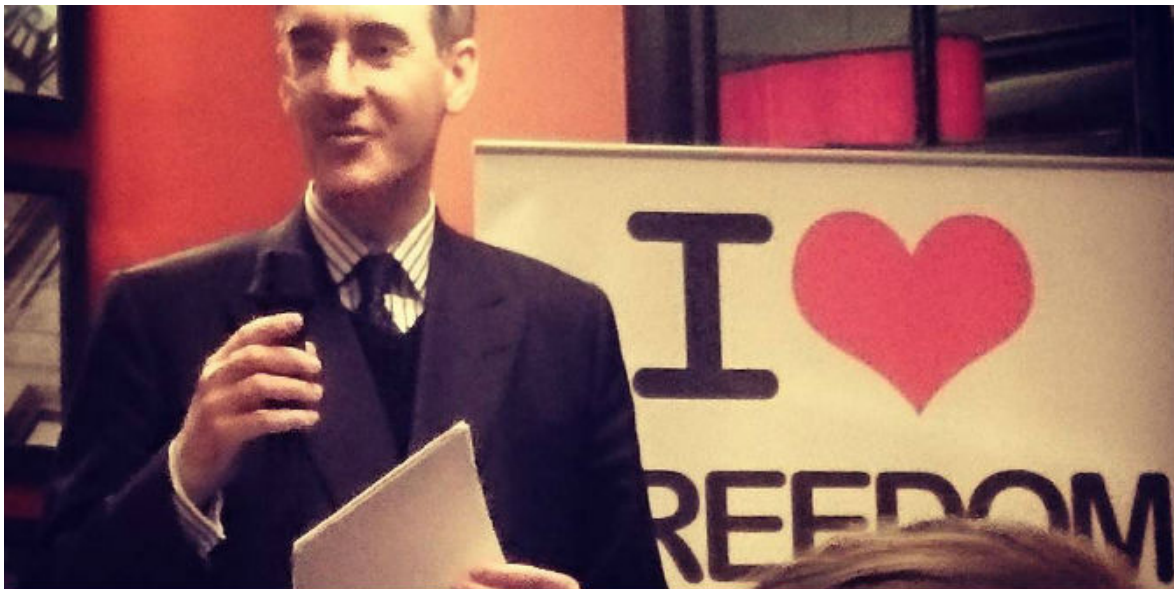
The idiosyncratic Conservative MP Jacob Rees-Mogg in 2015.

May had inherited a slender Commons majority from David Cameron, which, when she called the election, stood at just 17. In the House of Lords – which has been a permanently hung chamber since 1999 and has been increasingly willing to defy the government – she had no majority at all. A larger Commons majority would have given her more room for manoeuvre with her own MPs, and some more power with the Lords. To repeat a remark made by David Cameron at 7am on 23 June 2016: "Well, that didn't go according to plan".