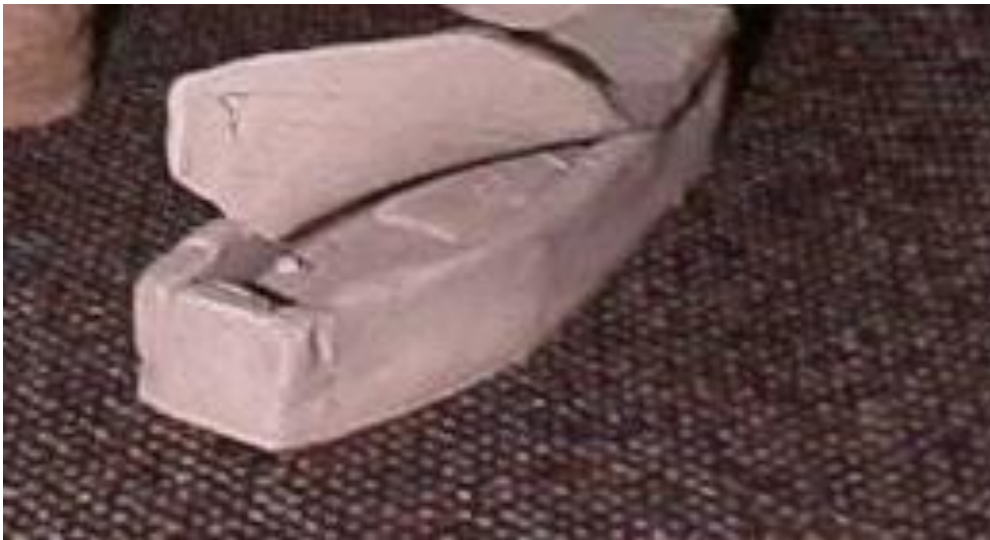
Figure 4: A coffin made of clay.

Sometimes it is necessary to establish this station outside of the recovery room although stations with soft toys, small bean bags, and inflated balloons may be provided inside. Following the death of the school football captain, many team members were reluctant to show any signs of emotion about this unfortunate and unpredicted suicide. The team members were engaged by passing a football around while they remembered the good times with the deceased, the victories and the losses, the friendship and the fun. Other strategies that can be employed include the use of clay, beating and kneading it, using gross muscle to free restricted and blocked feelings.