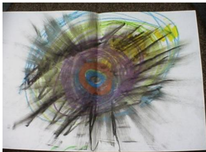
Figure 3: The explosion

This workstation could have a variety of musical instruments available, including whistles and perhaps a moog synthesiser and headphones, so as not to disturb others using the recovery room. A CD or DVD player can also be used by individuals to listen to preferred music or selected passages. The support person at this station could be aware of passages of music that interest the clients - have particular energy for the students while listening. These passages can be discussed. We prefer to use pre recorded soundtrack vignettes (2- 3 minutes) of music from major popular movies which are selected because of the variety of moods and emotions that will be evoked while listening to each piece. The clients are asked to listen to a short piece of music and to represent with paint, crayons, and/or pastels, what they are thinking and what they are feeling.