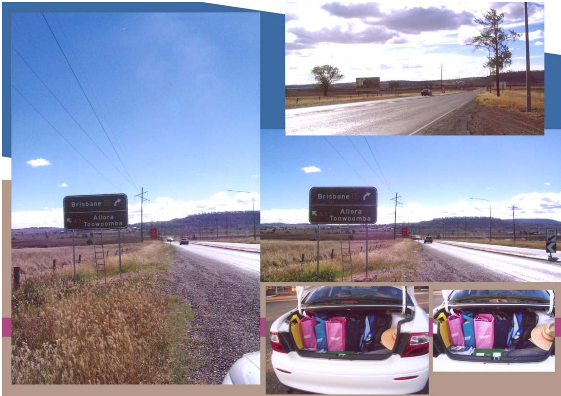
Figure 2: Student A's montage story

Another important issue that had a significant impact on students' adjustment to identifying as university students was their ability to organise this particular aspect of their lives within the constraints of their pre-existing Discourses. Each one of the students had different life circumstances that they needed to accommodate. As previously mentioned, Student A lived some distance from university and so it was necessary for her "life to become portable" in a sense, and the "boot" of her car was thus quite symbolic.