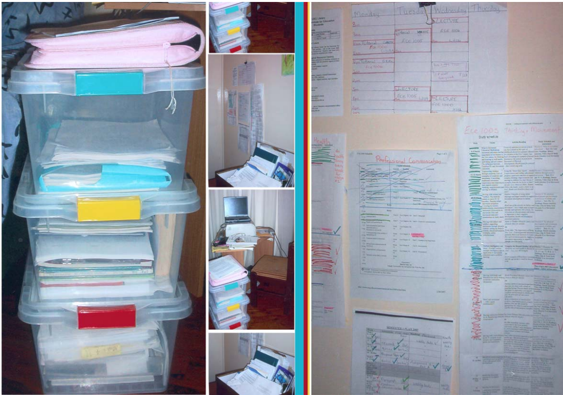
Figure 3. Student B's montage story

Here it is evident that the student's young child was impacted by the organisational strategies that were employed. The student had even encouraged her daughter to become a participant, as a way of encouraging a sense of inclusion and to make participation in tertiary education a "normal" part of daily life.