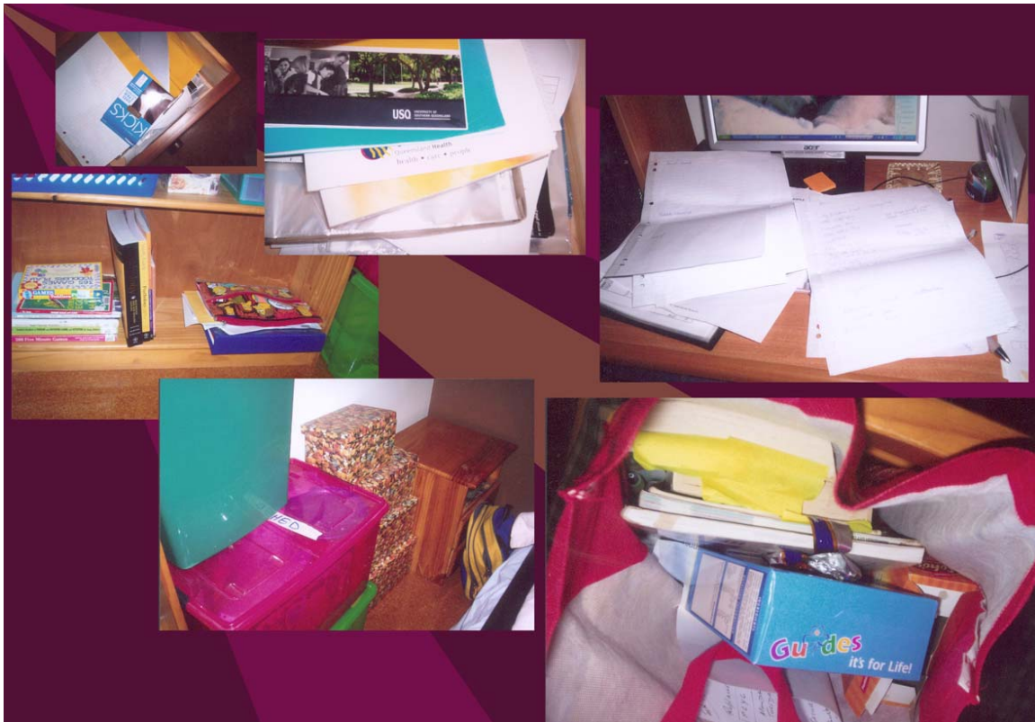
Figure 4: Student C's montage story

However, Student C realised that her study habits were changing and that she could no longer work in the same way. Referring to her photographic montage, she explained: