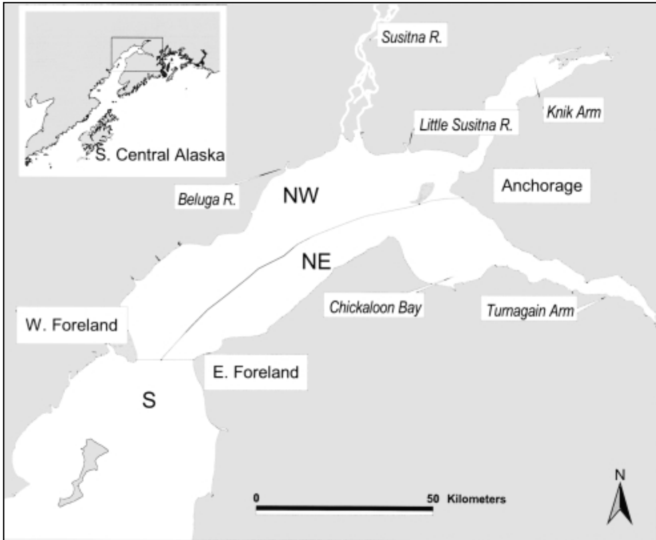
Figure 1.—Cook Inlet, in south-central Alaska, divided into three geographical sections for this report: 1) Northwest (West Foreland to Anchorage); 2) Northeast (Anchorage to East Foreland); and 3) South (lower Cook Inlet, south of the Forelands).

When possible, visual and auditory isolation was maintained between observers to allow independent search effort. This independent search was interrupted during weather checks and when circling groups. When groups were found, repeated counts were made using an extended racetrack flight pattern, such that observers always counted and video-recorded groups on the same side of the aircraft while passing them on a straight line. Generally, each observer had 4 opportunities to count each whale group encountered on each survey day.