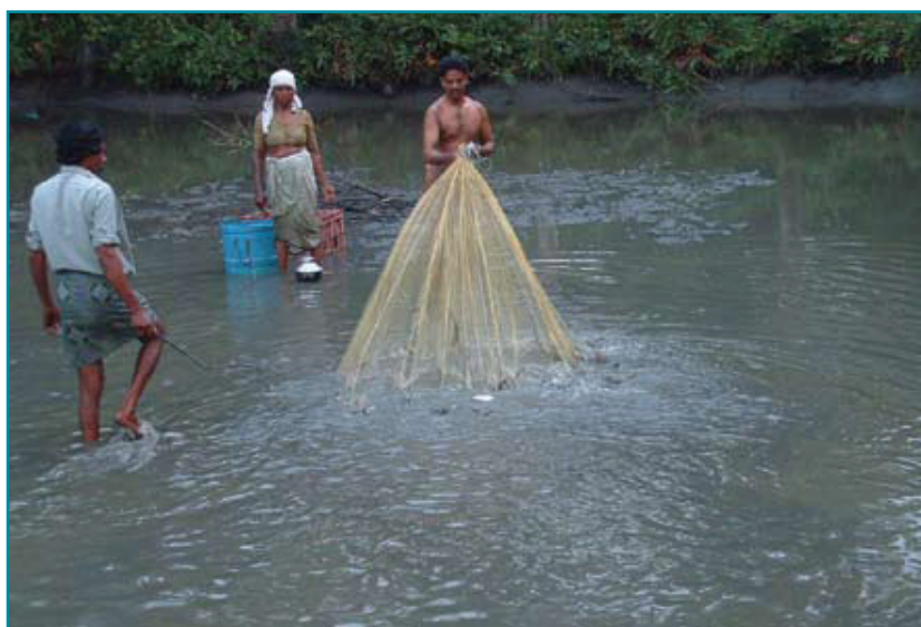
Farmer harvesting Chanos chanos – usually at night or early morning.

Polyculture of finfish was the recommended technology. Predators were eradicated using mahua oil cake. Water exchange was maintained through fabricated sluices and natural entry of fish was regulated. Combination of Chanos chanos and Mugil cephalus were stocked at the rate of 20 000/ha. Mugil cephalus at the harvesting stage attained a mean weight of 440 g and mean length of 35 cm, where the mean weight and length of Chanos chanos were 200 g and 26.5 cm, respectively. The period of culture was 11 months.