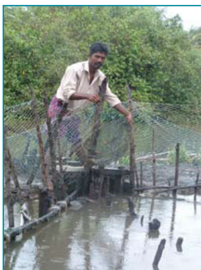
Biculture of crab and Mugil cephalus .

profitability with the diversification of farming practices resulted in an increase in the demand for farms. The fish/crab collectors, who were marginal fishermen, saw an increase in demand for their labor from about 80 to 120 labor days per annum (seasonal) and became conscious of the need for uniformity in the size of fingerlings for stocking. Farmers became aware of the components of culture practices like monoculture, biculture and polyculture. In the project village, an underutilized area of 22.3 ha was brought under the newly introduced fish culture practices. This created a demonstration effect on farmers from neighboring villages who visited the more progressive farms in the project village and also adopted the modified interventions. The increased level of awareness escalated the demand for unutilized ponds and embankments. Social participation and interaction among villages increased. This was more obvious in the case of women farmers. Inter and intra functional linkages between farmers, research stations, state departments and other organizations were evolved. Some farmers functioned as consultants and this gained them social recognition. Collective action among farmers