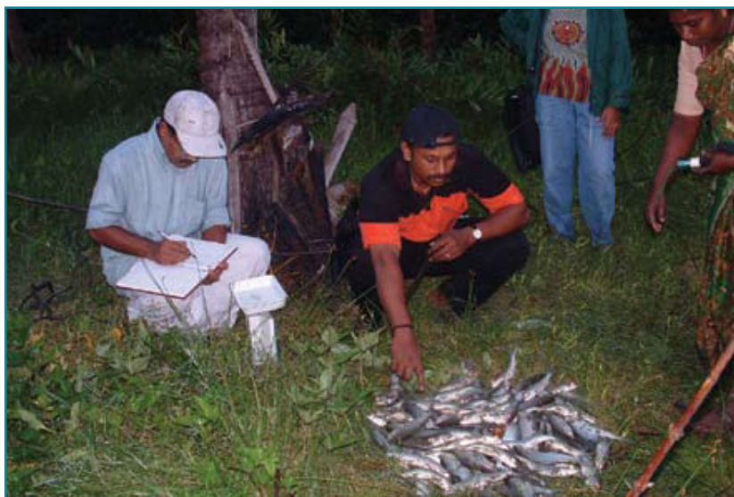
Harvesting of Chanos chanos .

The net return was Rs0.443 million/ha under the regime as against 0.254 million/ha with farmer's practices. The benefit/cost ratio was 1.64 and 0.96, respectively (Table 2).