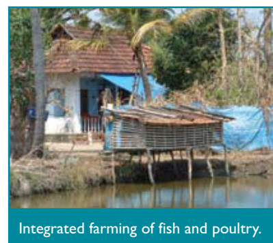
Integrated farming of fish and poultry.

There were a number of observations that indicated the positive impact of the resource-specific techno-interventions of IVLP in the project