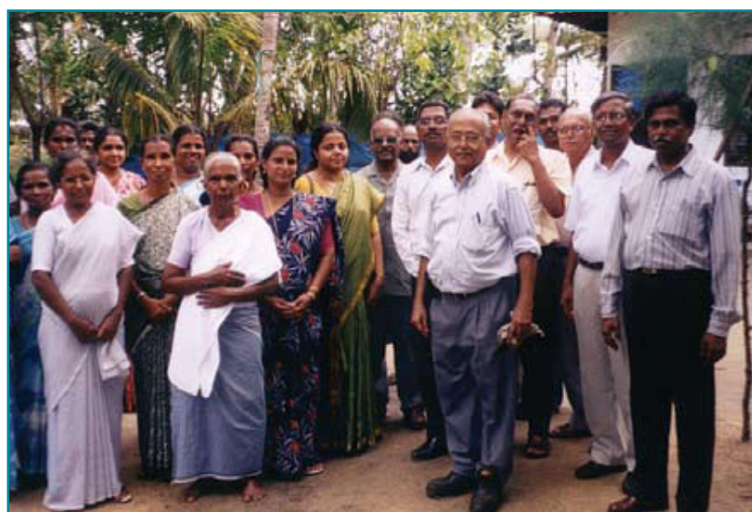
Group of stakeholders with experts.

The extension strategy adopted in IVLP is very much participatory in nature with a vision of an integrated whole village development ensuring greater scientist-farmer linkage and accessibility for farmers to the technologies generated by CMFRI