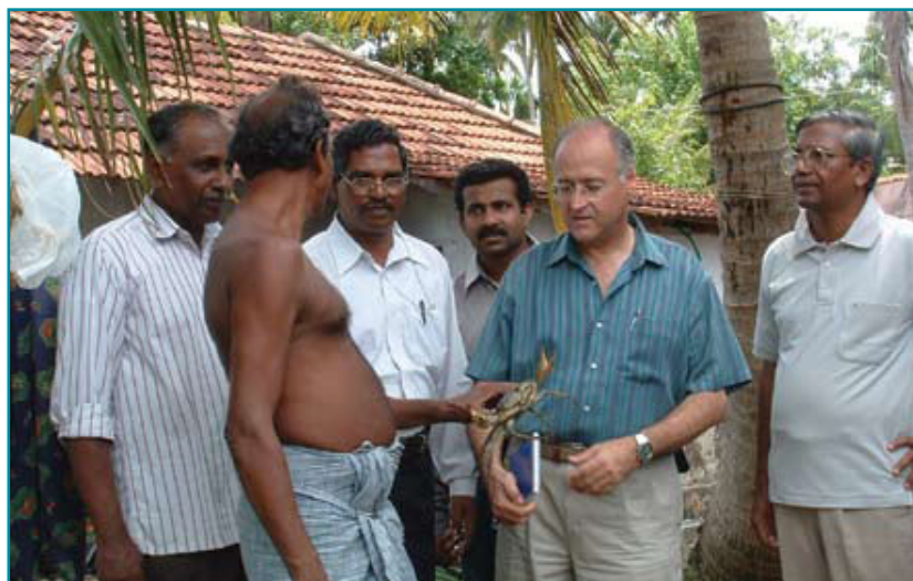
Mud Crab Culture – A remunerative venture.

Technology for the monoculture of uniform sized juvenile crabs ( Scylla tranquebarica ) was recommended. The major elements of the technology were: proper water exchange through fabricated sluices (size of sluice 60 cm width and 135 cm height); stocking of uniform sized juvenile crabs (stocking rate 4800/ha, size 150-200 g); feeding rate of 8-10 per cent of body weight with feeds such as trash fish and slaughter waste in the ratio of 2:1; and fencing of ponds (45° angle) using nylon nets to prevent crabs escaping