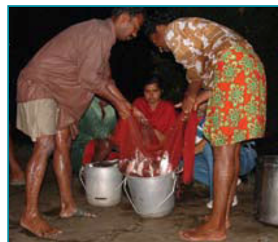
Harvesting of Mugil cephalus

Among IVLP farmers, 80 per cent preferred scientific fish/crab culture practices, whereas among 'others' 64 per cent of the farmers favored the scientific farming practices. It could be inferred that training and other extension activities succeeded in