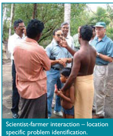
Scientist-farmer interaction – location specific problem identification.

The existence of five typical micro-farming situations such as tide-fed brackish water systems, open sea-based coastal agro-ecosystem, homestead animal husbandry and poultry farming system, rain-fed agro-horticulture systems and low-lying seasonal paddy ( pokkali ) lands were identified. Various technological interventions were sketched out to suit these micro-farming systems, on the one side, and to achieve the broader objective of technology assessment and refinement, on the other side. Based on this, an action plan was outlined under three broad categories - fisheries, livestock and