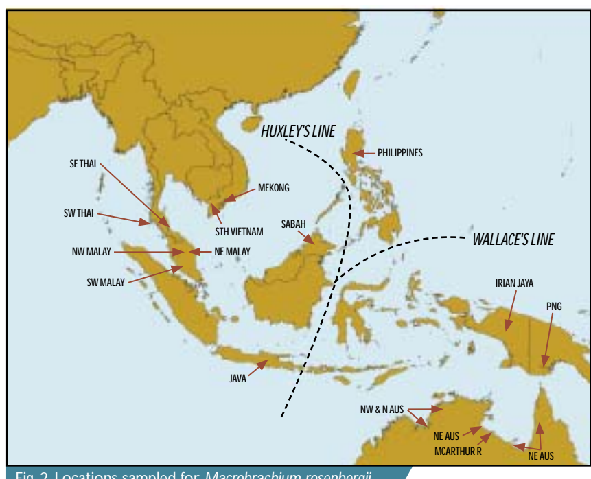
Fig. 2. Locations sampled for Macrobrachium rosenbergii

Whilst it is surprising that no molecular analyses (DNA-marker studies) have been undertaken on this species to date, the technique has proven very powerful and informative in other decapods where biochemical markers have proven conservative. Variation in the 16S ribosomal RNA mitochondrial DNA (mtDNA) gene has proven useful for addressing evolutionary relationships at both the interand intra-specific level in a number of major crustacean groups (Sarver et al. 1998; Crandall et al. 1999; Tong et al. 2000; Wetzer 2001). Thus, patterns of variation in mtDNA among wild stocks of M. rosenbergii can provide an independent and informative