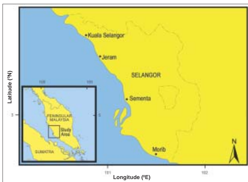
Fig. 1. Map showing the location of the study area.