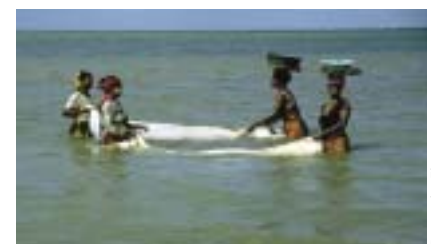
Quinea netting for small shrimps and fish is a widespread activity amongst coastal women of East Africa

The five million people living along the 800 km coastline of Tanzania are heavily dependent on marine resources. Most fish are taken in freshwater lakes in Tanzania. The marine catch comprises 15 per cent of the total catch and is generally poorly managed and in some cases under threat. One cause has been the extensive use of dynamite in coastal waters, which has not only damaged fish stocks but has also destroyed large tracts of coral reefs. In response, local communities initiated the