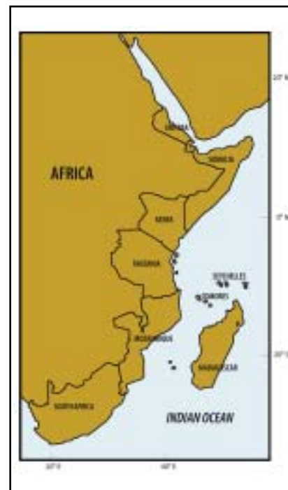
Map of the West Indian Ocean

Many of these initiatives were of an exploratory nature and, while they did generate interesting scientific data, they did little to assist the sustainable development of resources for the surrounding countries.