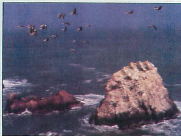
Fig. 1. Pelicans off the Peruvian coast—their much reduced populations reflect the much reduced populations of anchoveta, their main prey.