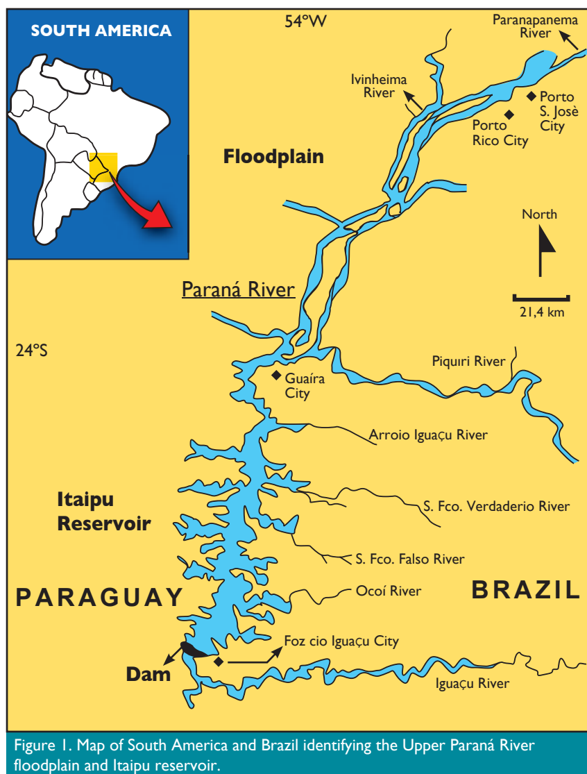
Figure 1. Map of South America and Brazil identifying the Upper Paraná River floodplain and Itaipu reservoir.

In order to infer the population response to impacts from two different ecosystems during two periods, the parameters K, L_{\infty} , M, QB and TL were estimated and compared for the 35 more abundant species from the upper Paraná river floodplain and the Itaipu reservoir.