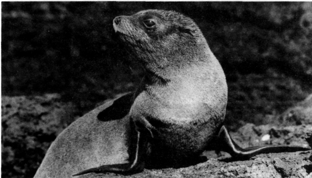
The population of Galapagos Fur Seals, Arctocephalus galapagoensis , suffered heavy losses during the 1982-83 El Niño but is since making a vigorous recovery

The marine iguanas Amblyrhynchus cristatus have shown themselves to be very vulnerable and poorly adapted to these changed times. They seem to depend upon certain species of algae and are unable to deal with many others because of the limited ability of their stomach microbes to break down the cellulose of cell walls (Andrew Laurie, pers. comm.). With the death of whole carpets of algae such as Ulva spp., the iguanas were doomed. Thousands died. Their skeletons now lie under nesting cormorants.