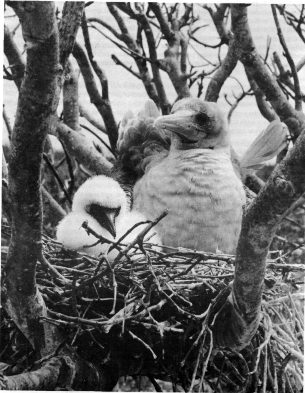
The breeding of the Red-footed Booby, Sula sula , was less affected by El Niño than that of the other seabirds.