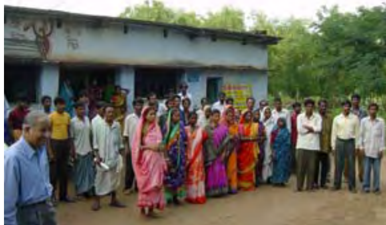
Kaipara community members in front of their OAS

Within the last year visitors from different countries such as Bangladesh and Australia have come to the OAS and appreciated its activities. People from other villages are also starting to come to