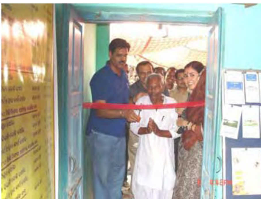
OAS inauguration in Patnagarh on 6 September 2005