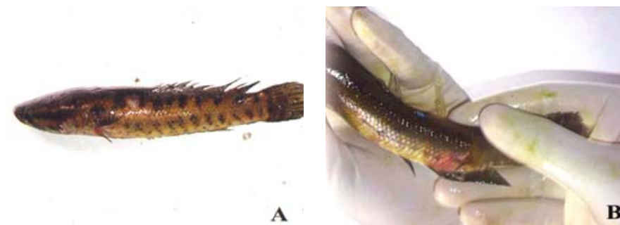
Wound healing in spotted murrel (A) and striped murrel (B).