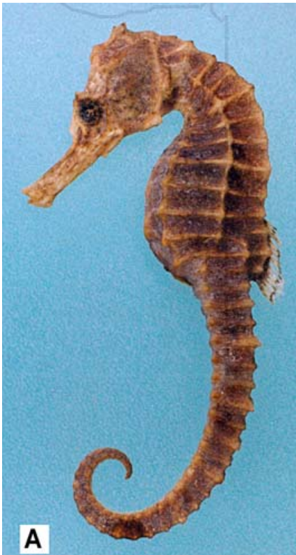
A Hippocampus borboniensis.