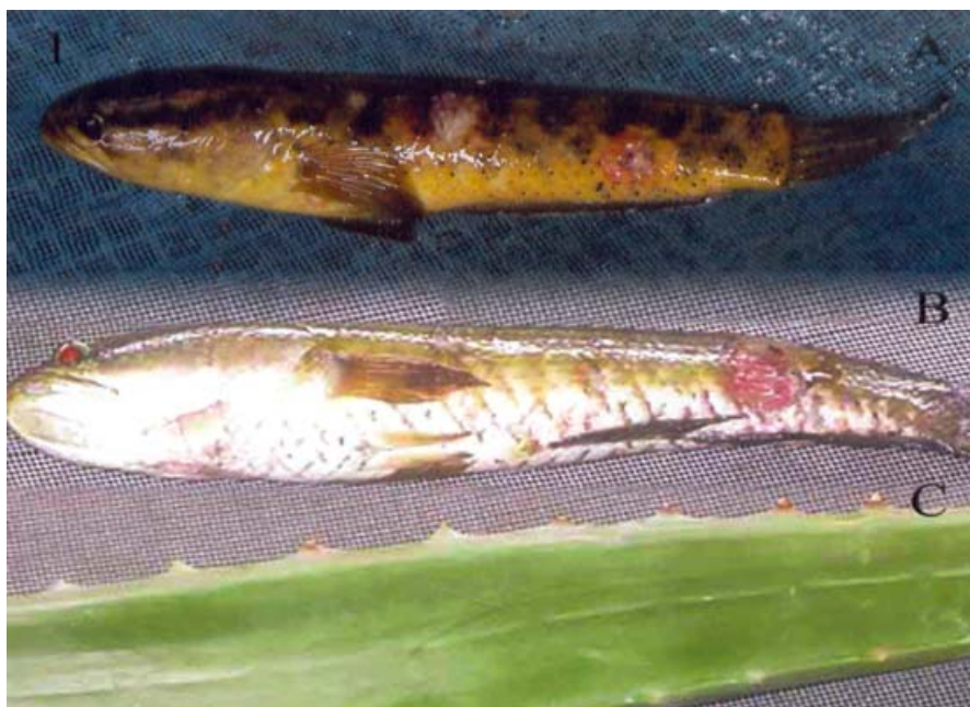
A & B: EUS affected spotted murrel showing abdominal lesions. C: Medicinal herb Aloe vera .

When compared to aloe paste, neem paste was more effective. In the case of