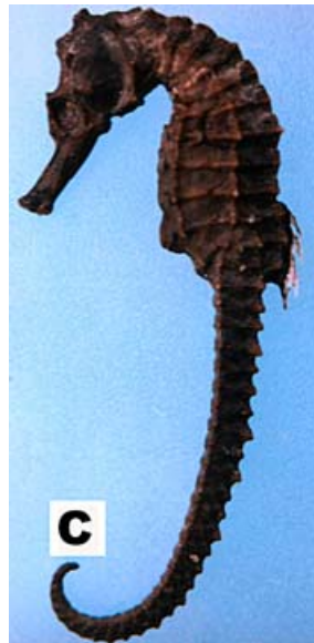
C Hippocampus kuda.