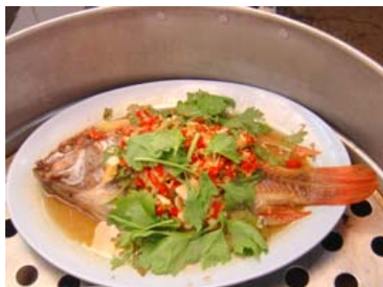
Freshly prepared red tilapia, Rangsit Market, Pathum Thani.

Red tilapia has been available for culture in Thailand since the mid-1980s when the Department of fisheries (DOF) developed a strain at the Ubon Fisheries Station. The fish performed well and there was considerable interest in its commercial potential but market-