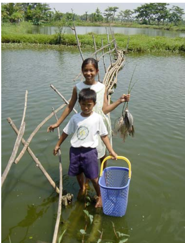
A farmer's daughter and son with tilapia caught for lunch.

the rest selling to retailers, consumers and brokers. Wholesalers/assemblers mainstreamed the harvests from the small-scale tilapia farmers live in aerated tanks to large consumer markets. This was facilitated by physical infrastructure such as roads, transport and communications.