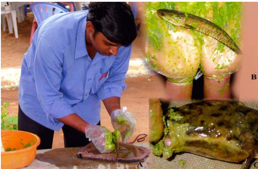
A&B: Topical application of neem paste to treat EUS-affected striped murrel. C: Neem paste being applied to xerophthalmia-affected spotted murrel.