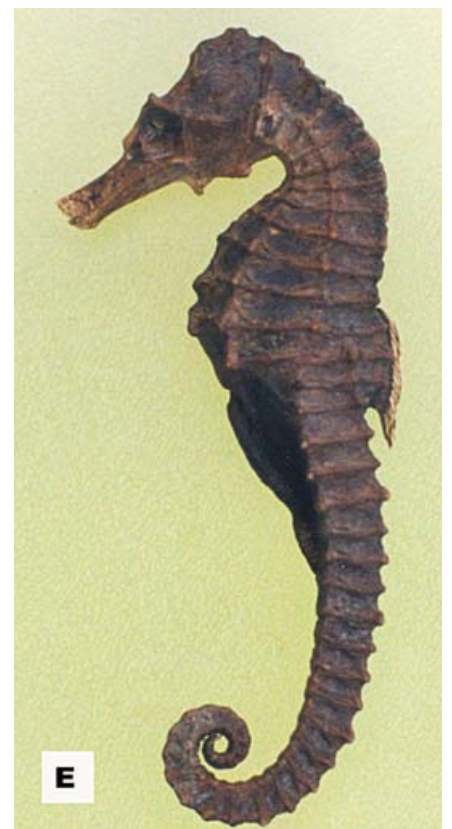
E Hippocampus fuscus.