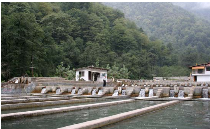
Trout farms producing from clear mountain waters of Iran produce fish of exceptional taste.