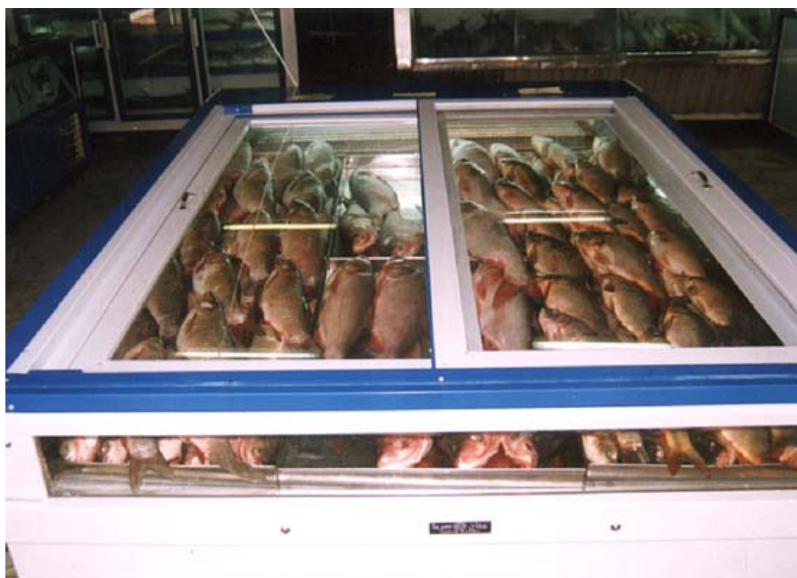
Marketing of Chinese carps, Tehran.