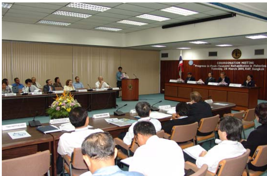
Opening of the coordination meeting on progress in post-tsunami rehabilitation of the fisheries sector.

Work on the projects began starting with the fisheries sector, which was by far the most heavily damaged with heavy losses throughout the six affected provinces of Thailand. Work later expanded to cover the agriculture sector (inclusive of fisheries, forestry and livestock) in Phang Nga and Ranong Provinces, which suffered the majority (>80%) of agricultural losses.