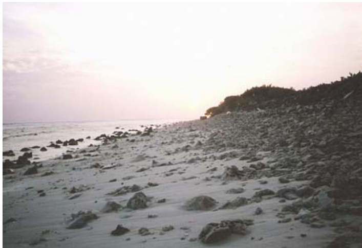
Loss of critical habitat such as coastal reefs is a threat to seahorse populations.

to be associated with seaweeds mainly during the two monsoon periods when the sea became rough and water was turbid. Although there was no organised trade in Kerala, the local fishermen ascribed some medicinal uses for seahorses, which were dried, powdered, and mixed with honey as a local remedy for asthma. It was also believed by many fishermen that seahorses could prevent epilepsy or other similar disorders, if kept attached to the body as a talisman.