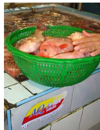
Live fish are kept in aerated tanks prior to sale.

two years however, and it is no longer common practice for feed dealerships to guarantee prices in advance, suggesting that the expansion of cage culture may have peaked.