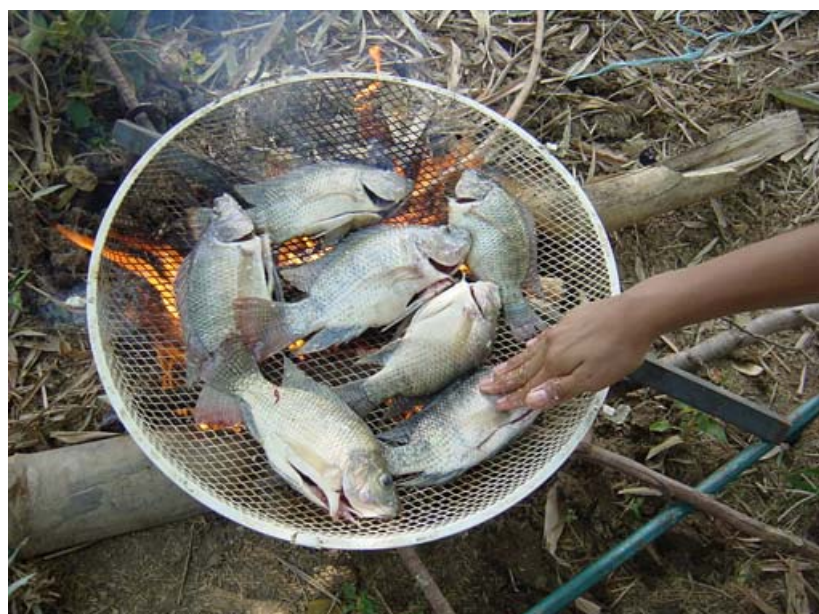
Tilapia broiled over a fire for lunch.

Tilapia pond farming is a profitable livelihood that contributes to reducing poverty in Central Luzon, but obstacles to entry must first be overcome. Access to livelihood assets, together with robust markets (input, output and labour markets), available services, facilities and infrastructure, and supportive policies and institutions are vital channels of effects for poverty reduction.