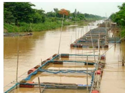
Red Tilapia Cages, Khlong 13, Pathum Thani Province.

CP initiated a form of contract farming, the first of its kind in Thailand for a freshwater fish, supplying fry and feed to franchised aquatic feed dealerships which oversaw the remainder of the production cycle. Dealerships nursed fry to stockable size, sold feed, and harvested and marketed fish when they attained 600g or more. This system proved attractive to potential market entrants as cage culture techniques were very simple to learn and feed dealerships provided initial technical support. The activity appeared predictable and relatively risk free for farmers because all fish over 600g were purchased at a set price upwards of Bt40($0.97)/kg. Dealerships offered