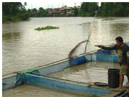
Feeding time, Bang Pa Kong River, Ban Sang, Prachinburi Province.

The uptake of cage culture has been rapid, with promotion by word of mouth following establishment of demonstration farms by feed dealerships, and most production occurs in localized clusters. Although the cost of cages and