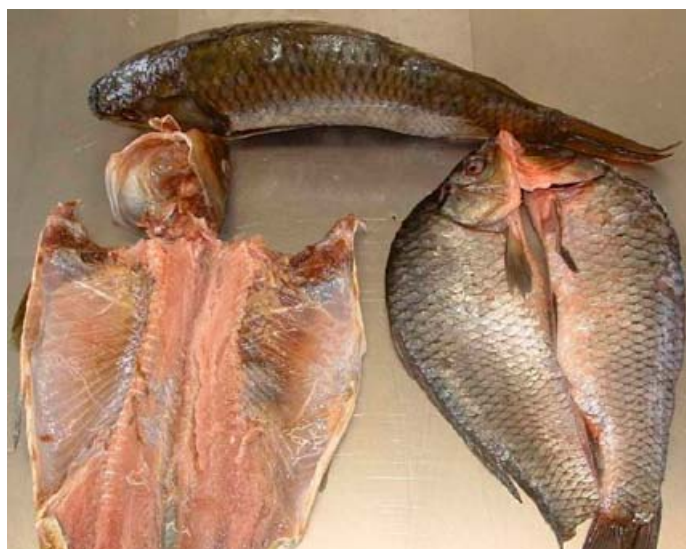
Fillets of Common Carp.