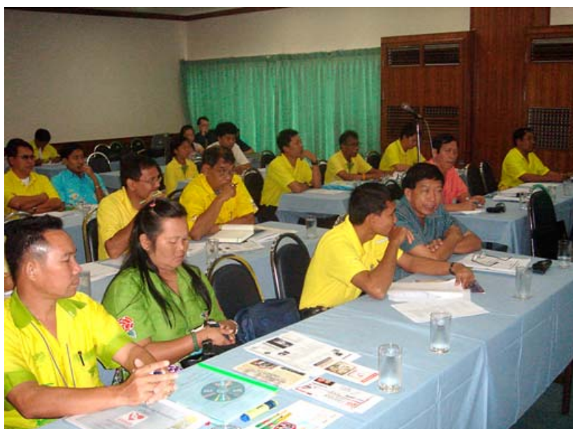
Participants in the coordination meeting in Phang Nga Province.

The Governors of Ranong and Phang Nga accepted these recommendations. Operational models and organisational arrangements for the Information Units were developed in discussion with the provincial MOACs,