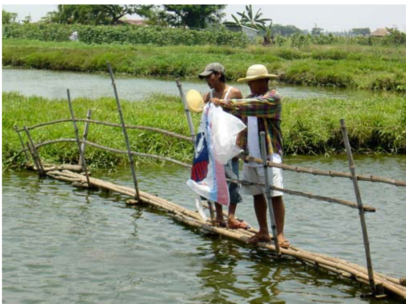
Feeding tilapia with commercial pelleted feed.

tilapia farming as their primary occupation with major secondary and other occupations being rice farming (21%), vegetable farming (12%) and livestock raising (12%) as well as driving, vending/trading, office employment and carpentry. Some 36% of tilapia farmers continued to grow rice in separate plots on their farm.