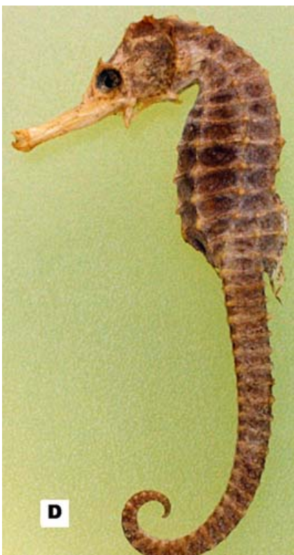
D Hippocampus trimaculatus.