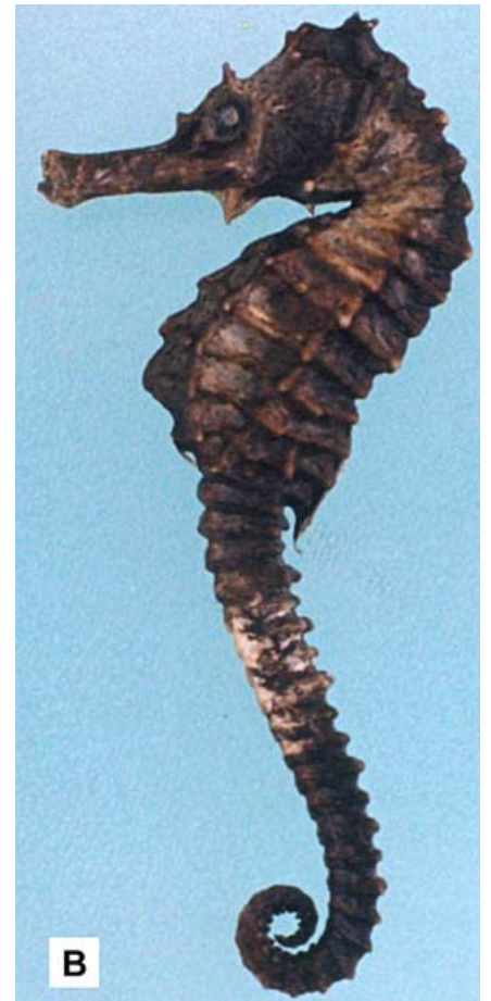
B Hippocampus spinosissimus.