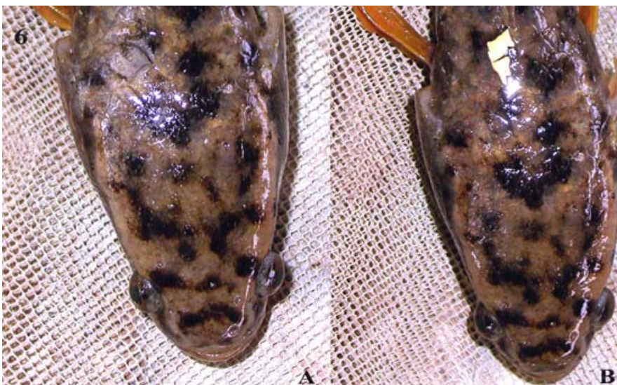
A: Partial recovery of xerophthalmia on third day of treatment. B: Complete recovery of xerophthalmia on sixth day of treatment.