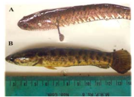
Complete recovery from EUS in striped murrel (A) and spotted murrel (B).

neem paste treated individuals complete wound healing was noticed on the 6th day of the treatment, whereas aloe paste treated murrels showed slower recovery and all the external wound disappeared on the 8th day of treatment. Diseased murrels with bulging eyes (xerophthalmia) showed recovery on the 3rd day after neem paste treatment and eye became normal on the 6th day, whereas aloe paste treated xerophthalmic C. punctatus became normal only on the 8th day.