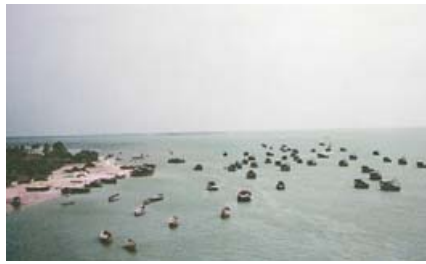
Fishing crafts bringing by-catch of seahorses in Gulf of Mannar coast of India.

Vincent (1996) reported the trade volume from India to be about 3.6 metric tonnes (1.5 million individuals) of dried seahorses per annum in 1995 while Salin et al. (2005) estimated the Indian seahorse trade to be 9.75 metric tonnes (2.65 million individuals) in 2001. Most of the catch was dried and exported to Singapore, Hong Kong and Malaysia in addition to some limited local consumption in folk medicine for treatment of asthma, fits and other illnesses. According to official estimates (Anon, 2003), about 2.53 metric tonnes of seahorses worth 1.5 million Rupees (US$ 40,000) were exported from India during 2000-01, mainly to Singapore, UAE and Hong Kong. This increased to 4.34 metric tonnes during 2001-02, worth 2.673 million Rupees (US$ 70 000), Chennai being the major port of activity. Apparently, the United Arab Emirates is only a transit point and most of the Indian exports are destined for Singapore or Hong Kong, countries with a sizeable population of ethnic Chinese communities.