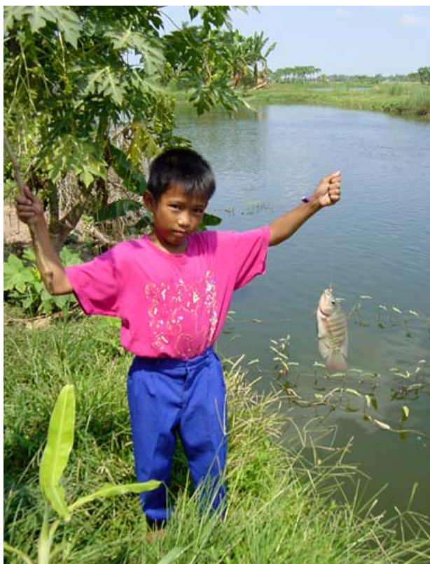
A farmer's son with a tilapia caught from a typical small-scale tilapia pond.