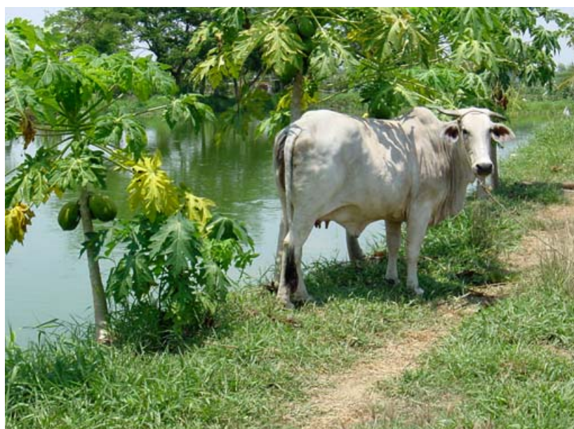
Papaya and cattle grazing grass on a pond dike on a multi-component farm.

Marketing tilapia was relatively easy for most farmers, most (77%) selling to wholesalers/assemblers with