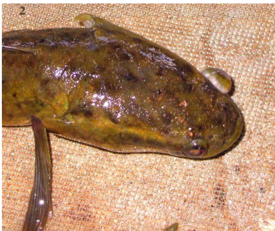
Xerophthalmia affected spotted murrel.