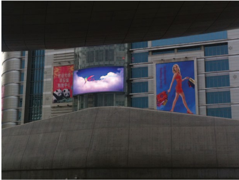
Fig. 1: Posters promoting shopping activity outside of a building in Dongdaemun district. Left poster is written in simplified Chinese characters with the image of pandas targeting Mainland Chinese tourists. The text reads: Welcome to the shopping centre.