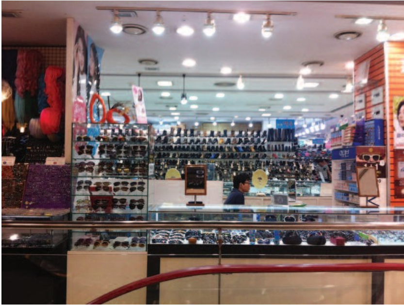
Fig. 3: Typical view of fast-fashion and mass-produced merchandises sold in a shopping mall in Dongdaemun.