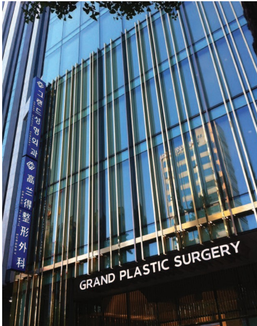
Fig. 2: A modern building dedicated to plastic surgery in the upmarket Gangnam district in Seoul.