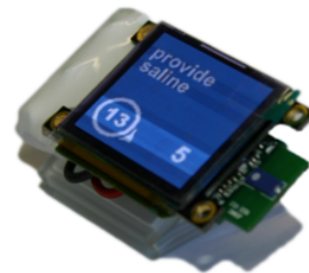
Fig. 3. Micro display prototype with a physical size of 51mmx30mm

As mentioned above, our major design issues are low energy consumption and wireless connectivity. For high-resolution display devices that are always on, power consumption of the display is the crucial parameter. Organic LED display technology features low energy consumption, wide viewing angles and improved brightness when compared to other display technologies and has therefore been chosen as the basis for ambient displays. Wireless connectivity is provided by a separate microcontroller with embedded ZigBee -IEEE