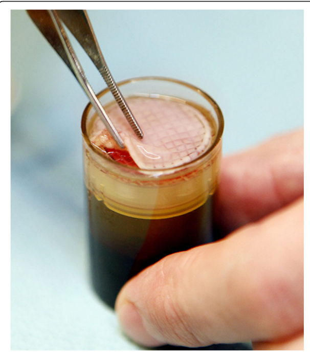
Fig. 1 A LeucoPatch® post centrifugation