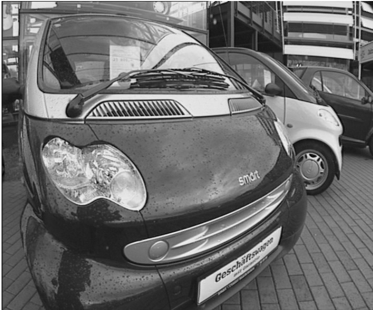
FIGURE 1: A fleet of smart™ cars at a dealership awaiting collection by customers.

congested city driving. It also has comparatively low environmental impact, not just in use but over all stages of the lifecycle. Neither fuel efficient small cars nor two cars are unique in Europe, but smart™ is innovative in several respects. This reflects its emergence from a partnership between Mercedes and Swatch – see BOX 1. It draws strength from Mercedes' presence behind the smart™ brand, the standard of product engineering, lively performance, a high standard of interior specification, and an emphasis on safety. The influence of Swatch is reflected in a strong fashion element in interior and exterior styling. These attributes combine to bring environmentally conscious car use closer to higher income, city-based consumers. The striking design of smart™ is shown in Figure 1.