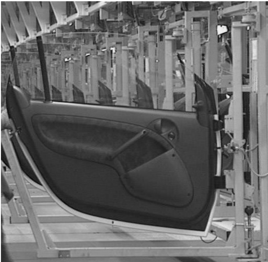
FIGURE 4: Detail of the left hand side door interior, showing fittings.

In Table 2 (g), (h) and (i) the sharing of risks is shown, in both the warranty of components and the potential loss or increase of the overall business of the product. The main impact of co-location is that the vehicle manufacturer, as site owner can look holistically at the entire site in order to carry out a comprehensive assessment of resource use on the site. The factory buildings (see Table 2 (f)) are all built from sustainable materials, and all processes within smartville are both CFC and formaldehyde free (Treneman, 2001). The factory also recycles the heat and power created and water used on the site. With off-site suppliers, additional environmental burdens need to be added to the overall analysis.