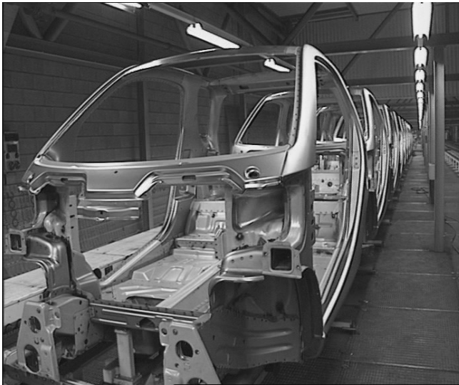
FIGURE 2: The Tridion™ safety cell, after complete assembly, by Magna Chassis, being conveyed to the main smart™ car production line.

The car was originally targeted as a second car, largely for city use, but it was also associated with initiatives that envisaged alternative approaches to individuals' mobility. These offered incentives for using cars like smart™ outside the prevailing owner-driver model. They include reduced public transportation fares for inter-modal journeys, reduced parking fees, preferential car rental agreements, and incentives for car sharing. In some parts of the EU, these initiatives have started to evolve – for example, via lower charges for parking and for car-wash – the latter reflecting lower use of water, detergents etc. Smart™ thus appears to be contributing to reducing impact from personal vehicle use, but on a limited scale so far, as is indicated by the unit sales figures previously shown in Table 1.