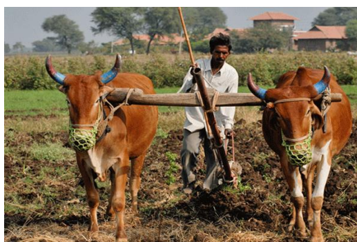
Farmer ploughing his land.

The farmers view lack of labour as a challenge and the family members are involved in all farming activities since they cannot afford to buy in labour. In the groups the farmers and their families could work together on time consuming and labour intensive tasks. It could pose a problem that the farmers are growing the same crops since this means that the different tasks need to be done at the same time. If the farmers help each other this could free more time for their children to attend school and do homework. Since the whole family is involved with the farm work, it could be relevant to create learning groups which include all family members.