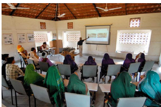
BioRe training center.

Maikaal bioRe also provides extension service. During the growing season the farmers are visited by extension officers (monthly basis) to give technical advice. The farmers apply farmyard manure, compost and neem cake (10 kg N/ha) to the fields as well as biodynamic inputs (de-oiled castor cake, cow horn manure and cow pat pit manure). Farmers buy seeds from Maikaal bioRe and if needed also other inputs such as rock phosphate and bio-pesticides (Panneerselvam 2010).