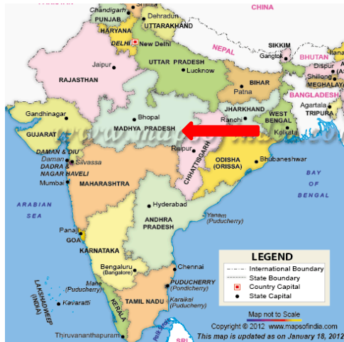
Figure 5.1. Map of India showing the state of Madhya Pradesh. The most northern state Jammu & Kashmir is not visible.

The state of Madhya Pradesh lies in the central part of India (figure 5.1) and is the second largest Indian state with an area comprising of 308 thousand km 2 . 75% of the population is rural, predominantly marginal and small holder farmers and it is estimated that 28% of the population of 60 million people live below the poverty line. Approximately 65% of the total land holdings belong to marginal and small holder farmers. However, they only occupy 26% of the arable land. About 80% of the farmers have less than one hectare of land (ASSOCHAM 2012).