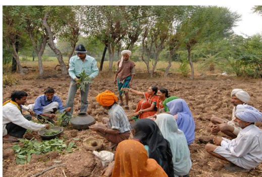
Farmers making preparations.

Small holding farmers are generally resource poor, hence reducing inputs is of major importance. The case farmers spend less than one third of conventional input costs. However, they still rely on biodynamic inputs and bio-pesticides from bioRe. Making biodynamic preparations is knowledge intensive and time consuming. It could be an advantage for the farmers to make the preparations together while exchanging knowledge on the subject. Since the farmers find control of pests and diseases a challenge, another focus could be further development of agro-ecological practices to avoid this.