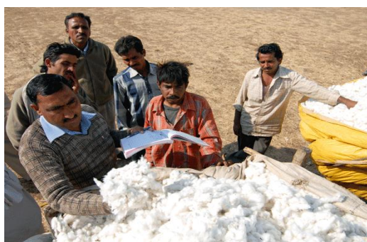
Quality control during purchase of cotton.

The PhD thesis provided data from 35 certified organic farms that had been organic for 2-8 years. As shown in table 5.1 each small holding has a mean landholding of 1.5 hectares and on average 5-6 heads of livestock. The cotton is sown in May-June and is mostly intercropped with soybean, pigeon pea and urad bean (lentils). Wheat is sown in November-December and harvested in March-April. On average each farm harvests 1 ton of cotton, 822 kg of mainly wheat, 42 kg of pulses and 101 kg of oilseeds per year.