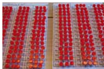
Fig. 1 Preparation of double-blinded samples for the triangle tests in a balanced serving plan.

There is a need of scientific evidence on the differentiation of organic from conventional produce concerning health, nutrition and sensory related qualities (Leifert et al., 2007). Analysis of wheat from the DOK long-term system comparison trial near Basel, Switzerland (Mäder et al., 2002) showed that organic wheat differed in contents of 16 “diagnostic” proteins from conventional wheat (Zörb et al., 2009a), had higher concentrations of K + and Mg 2+ cations and lower concentrations of six amino acids, and a different seed ripening metabolism (Zörb et al., 2009b). In a previous sensory test with cooked porridge of wheat (cv. Tamaro) from the DOK trial (harvest 1999), the biodynamic samples had been preferred (Arncken et al., 2007). In the present work we aimed to corroborate these results with dry samples of three harvest years.