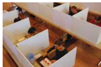
Fig. 2 Triangle tests in individual, mobile sensory booths at FiBL.