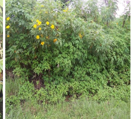
ArtimisiaTephrosia sppTithoniaGrow herbs for bio-pesticides, medicinal use and plant fertilizer