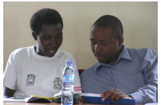
The exercise starts with couples discussing the issue and together identify the focus of the discussion and exchange opinions and idea.

- a way that allows everybody to reflect and stimulate negotiation about rather big and complex questions and issues