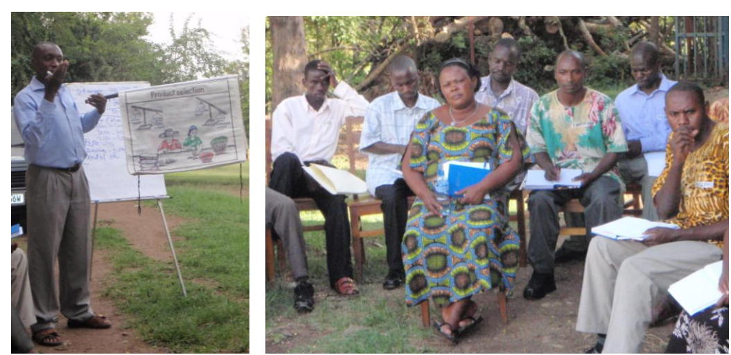
In general, when the learners find the topic relevant and it is open for questions and discussions then the learning situation will be intense.

Make class room lectures and presentations lively by moving around in the class room, or move outside.