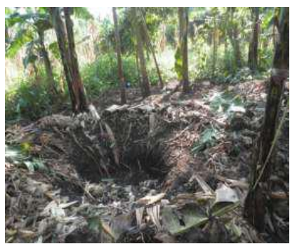
Compost making manure using plant material

Figure 1: Examples of agro-ecological methods which can be used in organic farming. A lot of manuals go more in-depth – the photos below are just some examples.