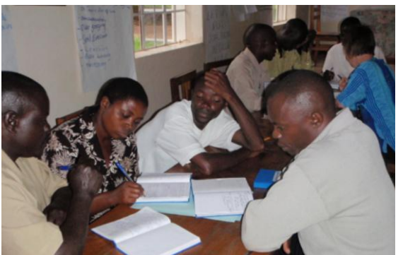
After e.g. 10 or 15 minutes of couple discussions, two couples merge to form groups of four to discuss the issue.