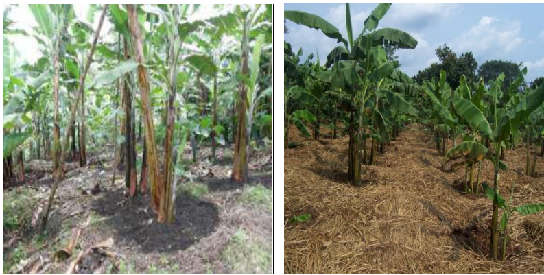
Mulching - keeps fertility and soil moisture

Trench digging (and planting stabilizer grass or shrubs on edges) to prevent soil erosion