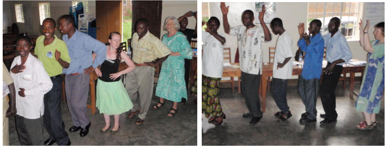
Singing the song 'SEEING IS BELIEVING': When I see I remember – when i do I understand, when I am told I forget – seeing is believing!