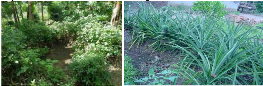
Water catchment in mandalas

Improved stove – saves wood fuel and gives less smoke