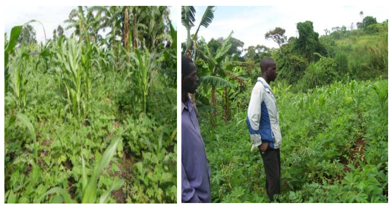
Diversified gardens and farms