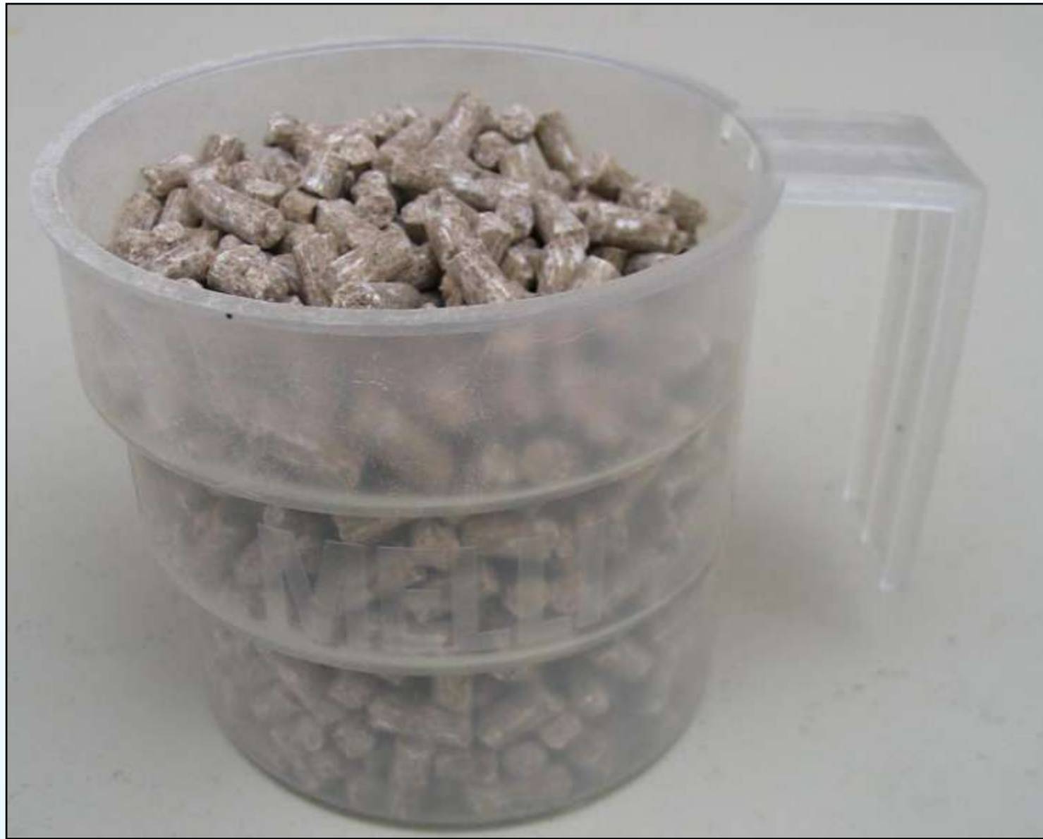
Fig. 2. Experimental mixture.

1 University of Joensuu, Faculty of Biosciences; 2 Agrifood research Finland