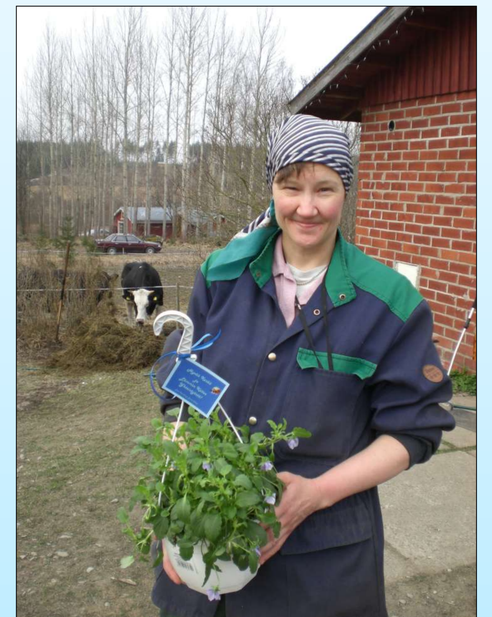
Fig. 1. A participant farmer.